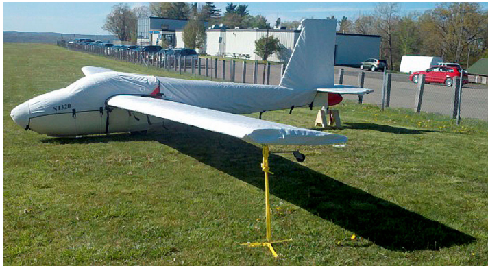
SGS 1-26B Canopy/Nose, Empennage & Wing Covers