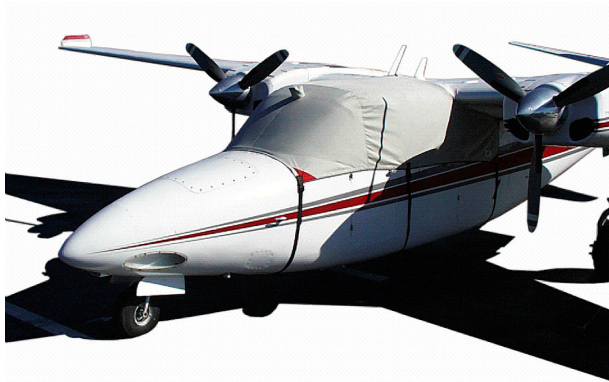
Aero Commander 680 Canopy Cover

Travel Covers are made with Silver Solution-Dyed Polyester fabric and only lined over the windshield to save weight. The material is lightweight and more compact for easy stowage in the aircraft. The polyester material is water resistant, but only intended for occasional use outside. We also have an ultra lightweight material available for fitted hangar dust covers. For daily outdoor use, the non-travel Sunbrella Cover is the best choice.