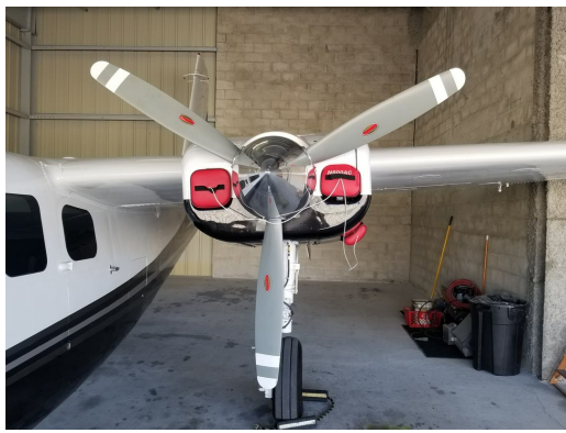
Aero Commander 500-A Engine Plug Set