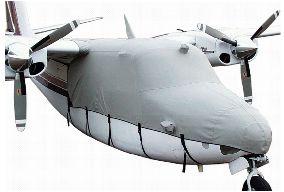
Canopy/Nose Cover (extends over top past leading edge)