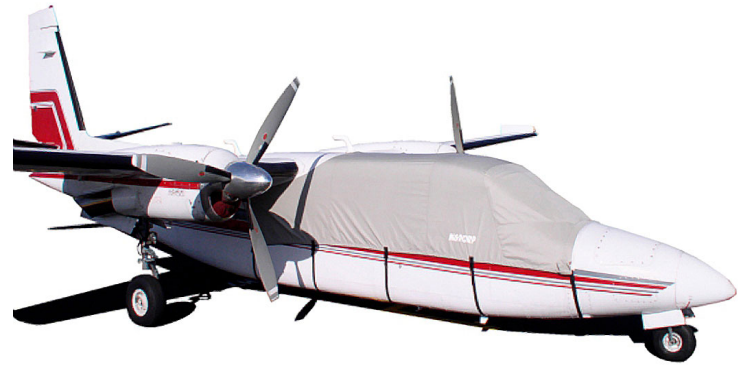
Aero Commander 690b Canopy Cover