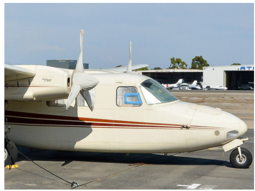
Aero Commander AC500 Propellor/Spinner Covers