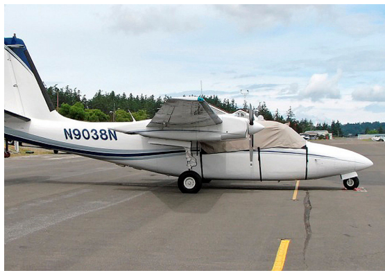
Aero Commander 500 Canopy Cover