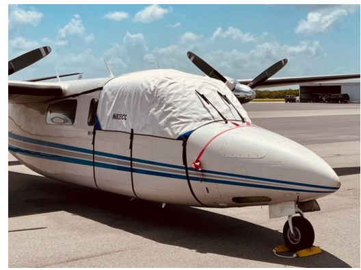
Aero Commander 690C Cockpit Cover