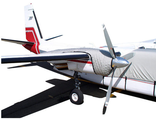
Aero Commander Insulated Engine Cover