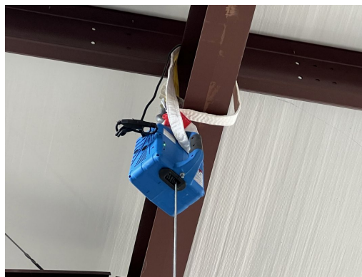
Stearman PT-13 Full Body Dust Cover, Remote Control Winch