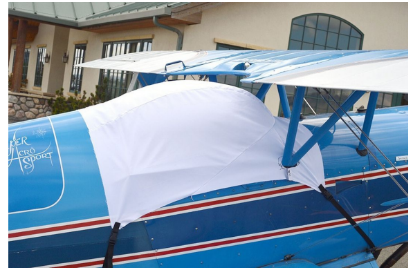
Acro Sport Canopy Cover