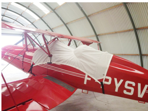
Starduster Too Canopy Cover