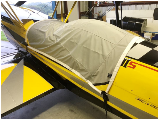
Acro Sport Acro II, Acroduster Travel Cover, Light Weight Travel Canopy Cover