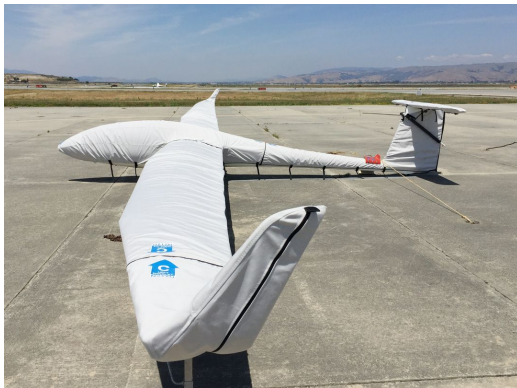
Schempp-Hirth Discus 2B Full Cover Set

WINTER USE MATERIAL - Made with Solution-Dyed Polyester fabric, this option is intended for seasonal use to aid in deicing, rain mitigation, or for occasional travel. The material is lighter and more compact, but more susceptible to UV damage and may have a shorter useful life if used continuously outside than the all-year use material.