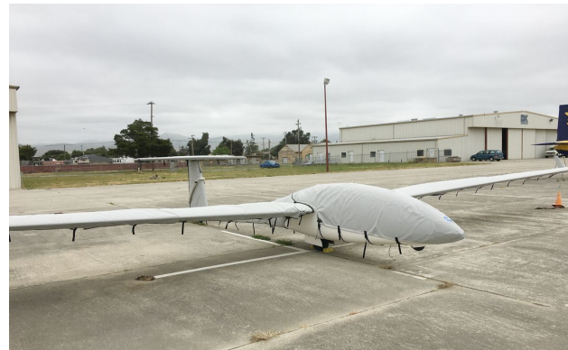
DG-505 Canopy/Nose, Wing, Empennage & Horiz. Stab. Covers