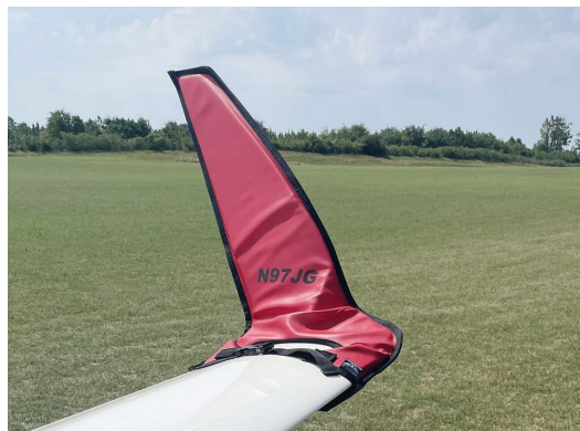
Schempp-Hirth Ventus-2B winglet/wingtip pads

Designed to prevent damage to the wingtip in crowded hangars or high traffic areas, these products are made of bright red Naugahyde and thickly padded with a sandwich of closed cell foam. Protects delicate winglets, casters and their housings, and soft finishes.