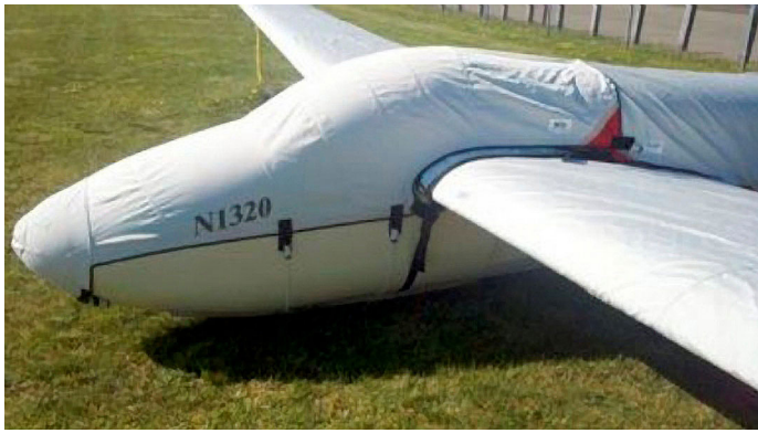
Schweizer SGS 1-26B Canopy/Nose, Wings & Empennage Covers

the hottest of days. It is water, ice and snow repellent, yet breathable to allow moisture to escape from between the cover and the aircraft surface.