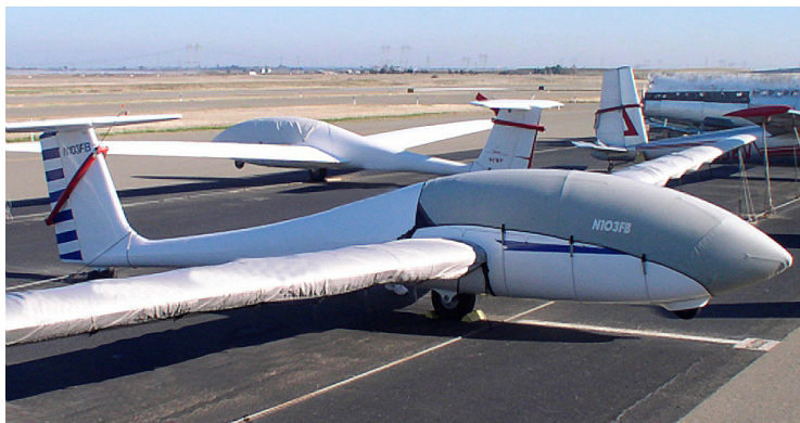
Grob 103 Canopy/Nose Cover and Wing Covers