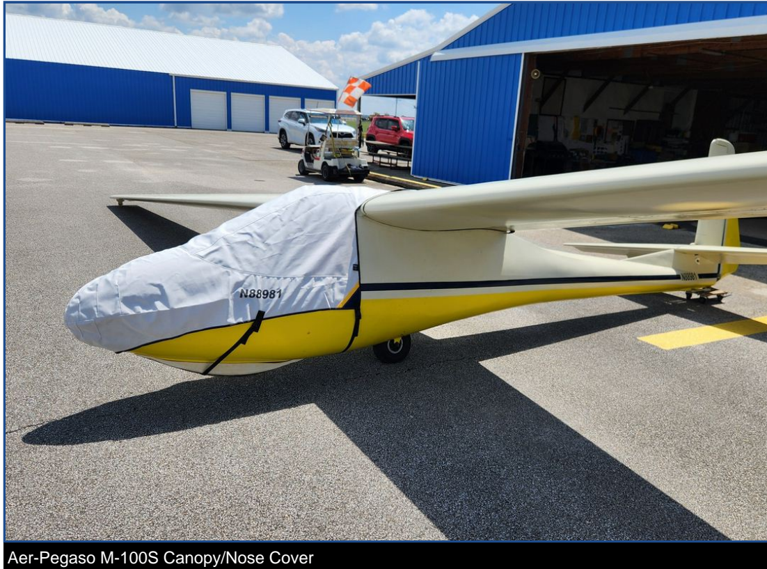
Aer-Pegaso M-100S Canopy/Nose Cover