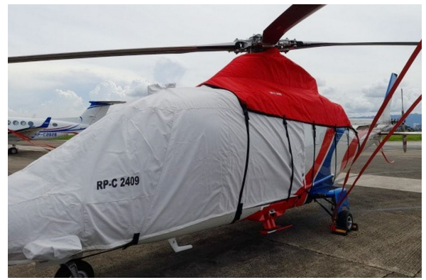
Agusta Grand AW109 SP Bubble & Engine Covers