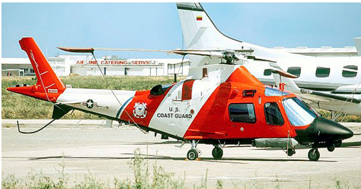
Covers, Plugs, HeatShields and related items for the Agusta MH-68A