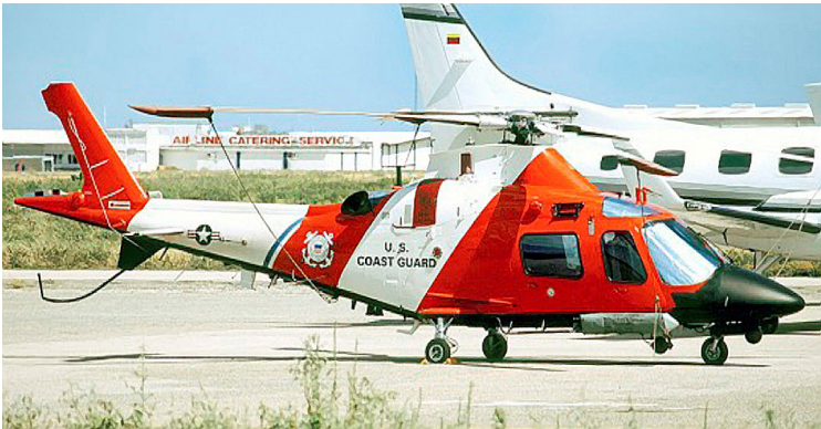
Agusta 109 Bubble, Rotor Hub & Blade Covers (illustration) Covers, Plugs, HeatShields and related items for the Agusta MH-68A