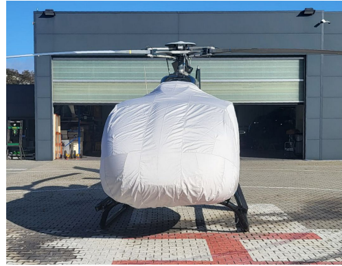
Airbus Helicopter H-130 Bubble Cover, Extends To Cover Fwd Engine Inlet