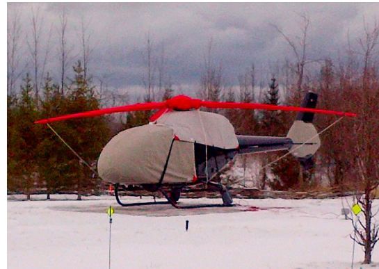
EC-130 Bubble, Engine, Rotor Hub, Blade & Tailfan Covers