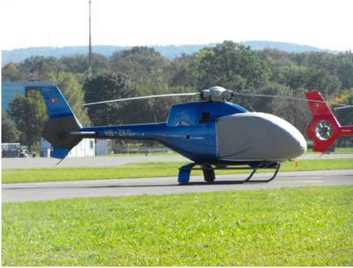
EC-130 Bubble, Tailfan, and Rotor Hub Cover

This cover type is made from Silver Acrylic Sunbrella canvas and is 100% lined with a soft and smooth microfiber. Bruce's Custom Covers developed this material combination especially for aircraft protection. The outer material is medium weight and treated for water resistance, UV resistance and anti-static buildup. The inner lining is a very soft and smooth microfiber to prevent scratching. The material is very reflective, and tests show that the cabin interior temperature can be reduced to near-ambient temperature on the hottest of days. It is water, ice and snow repellent, yet breathable to allow moisture to escape from between the cover and the aircraft surface.