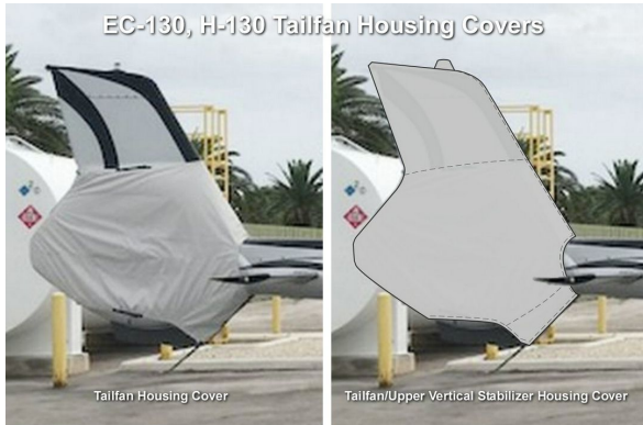
Airbus Helicopter H-130 Tailfan Housing Covers

The Tailboom Cover details vary by model, but generally the helicopter tail boom cover encloses the tail boom from the "bottleneck" to the aft end. They usually also cover the horizontal stabilizers, and are custom made to allow for antennae, lights, and other protrusions. They attach with straps underneath the tail boom. Covers for the vertical and horizontal stabilizers are also available separately. Specific information for each model is available on request.