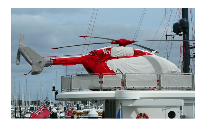
Eurocopter EC-135 Bubble, Engine, Rotor Hub, Tail Surfaces Covers