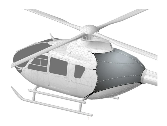
EC135 Exhaust Area Cover, illustration

The Airbus Helicopter EC-135 Intake Cover. Details vary by model, but generally helicopter intake covers are designed to enclose the intake are only. They are smaller than helicopter engine covers, and their attachment details can vary from straps, to snaps, or some combination of the two. Specific information for each model is available on request.