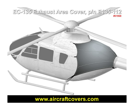
EC135 Exhaust Area Cover, illustration