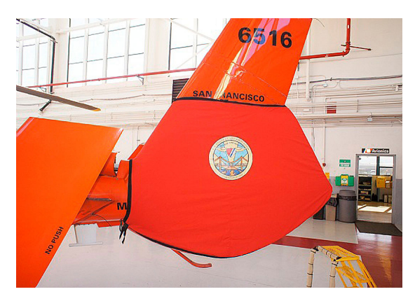
MH-365C Dauphin Tail Fan Fenestron Cover