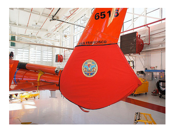
MH-365C Dauphin Tail Fan Fenestron Cover