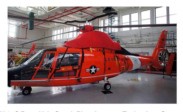
MH-65C Rotor Hub, Swash Plate Aperture, Engine Area Cover set, P/N: A365-210