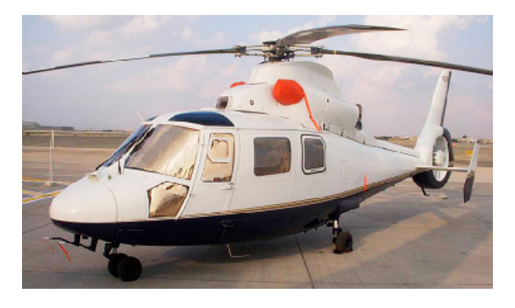
Dauphin HeatShield Set

Heatshields are interior sunshades for an aircraft's windows or canopy glass. The product is a unique composite of closed-cell foam with a silver mylar finish. The semi-rigid design is stiff enough to stand along the inside of the windshield using sun visors or window framing. It folds up flat and easily stores in the included storage sleeve. Some designs may require velcro and suction cups. A Heatshield is an excellent short-term remedy for cockpit overheating.