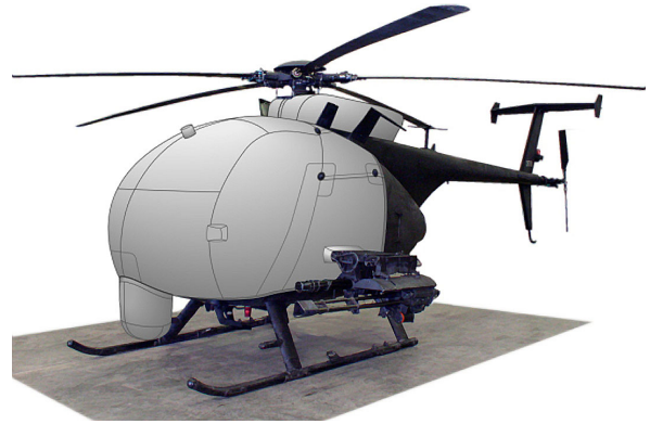
MH-6J Bubble, Flir & Doghouse Covers (illustration)