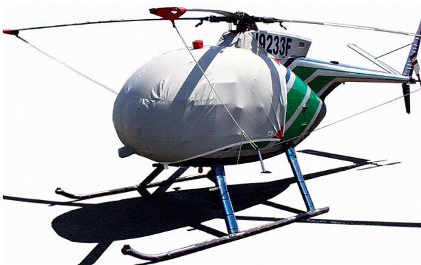
Hughes 500C Bubble Cover with Intake Add-on, Blade Tie-downs

WINTER USE MATERIAL - Made with Solution-Dyed Polyester fabric, this option is intended for seasonal use to aid in deicing, rain mitigation, or for occasional travel. The material is lighter and more compact, but more susceptible to UV damage and may have a shorter useful life if used continuously outside than the all-year use material.