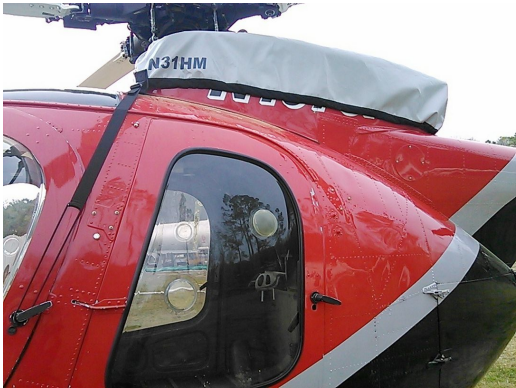
Customized Engine Cover