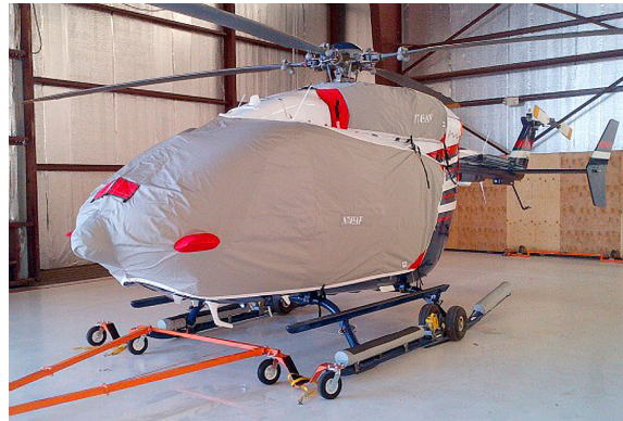
Bubble Cover w/ nose mounted radome & Upper Deck Plugs/Cover