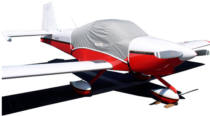
Van's RV-10 Canopy Cover

Travel Covers are made with Silver Solution-Dyed Polyester fabric and only lined over the windshield to save weight. The material is lightweight and more compact for easy stowage in the aircraft. The polyester material is water resistant, but only intended for occasional use outside. We also have an ultra lightweight material available for fitted hangar dust covers. For daily outdoor use, the non-travel Sunbrella Cover is the best choice.