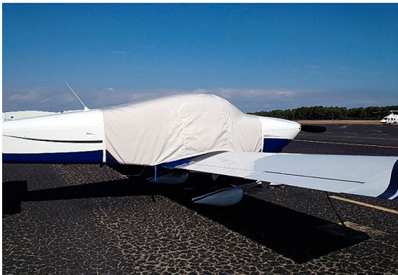
Van's RV-10 Extended Canopy Cover

This cover type is made from Silver Acrylic Sunbrella canvas and is 100% lined with a soft and smooth microfiber. Bruce's Custom Covers developed this material combination especially for aircraft protection. The outer material is medium weight and treated for water resistance, UV resistance and anti-static buildup. The inner lining is a very soft and smooth microfiber to prevent scratching. The material is very reflective, and tests show that the cabin interior temperature can be reduced to near-ambient temperature on the hottest of days. It is water, ice and snow repellent, yet breathable to allow moisture to escape from between the cover and the aircraft surface.