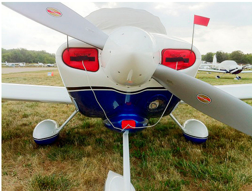
Van's RV-10 Canopy Cover & Engine Inlet Plugs

Engine Inlet Plugs are custom fit for your Direct Fly Alto intakes, made with heavy-duty vinyl material, and stuffed with a single block of sculpted urethane foam. Each plug has a zipper that allows the foam to be removed and dried if necessary. Engine plugs have warning flags that are visible from the cockpit or 'remove before flight' streamers sewn onto the face of the plugs. Most plugs are imprinted with the aircraft registration number in black for an extra charge. Storage bag NOT included. Engine plugs may be inserted after flight when the engine is still warm. Engine Inlet Plugs are commonly referred to as Cowl Plugs, Intake Plugs, Cowl Blocks, Engine Blocks, and Engine Bungs.