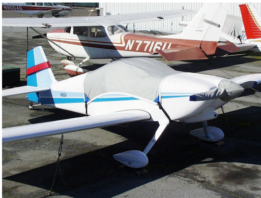
Vans's RV-6 Canopy Cover, Prop Cover

This cover type is made from Silver Acrylic Sunbrella canvas and is 100% lined with a soft and smooth microfiber. Bruce's Custom Covers developed this material combination especially for aircraft protection. The outer material is medium weight and treated for water resistance, UV resistance and anti-static buildup. The inner lining is a very soft and smooth microfiber to prevent scratching. The material is very reflective, and tests show that the cabin interior temperature can be reduced to near-ambient temperature on the hottest of days. It is water, ice and snow repellent, yet breathable to allow moisture to escape from between the cover and the aircraft surface.