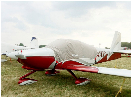
Van's RV-10 Canopy Cover

This cover type is made from Silver Acrylic Sunbrella canvas and is 100% lined with a soft and smooth microfiber. Bruce's Custom Covers developed this material combination especially for aircraft protection. The outer material is medium weight and treated for water resistance, UV resistance and anti-static buildup. The inner lining is a very soft and smooth microfiber to prevent scratching. The material is very reflective, and tests show that the cabin interior temperature can be reduced to near-ambient temperature on the hottest of days. It is water, ice and snow repellent, yet breathable to allow moisture to escape from between the cover and the aircraft surface.