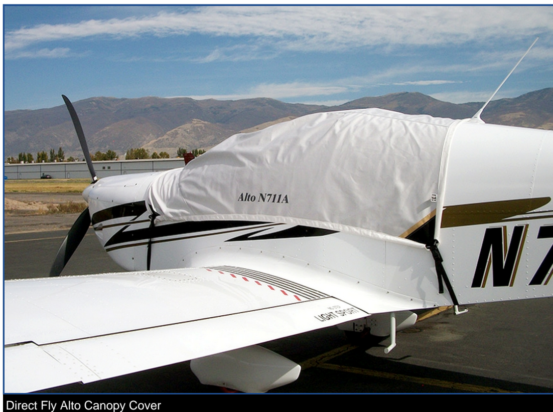
Direct Fly Alto Canopy Cover