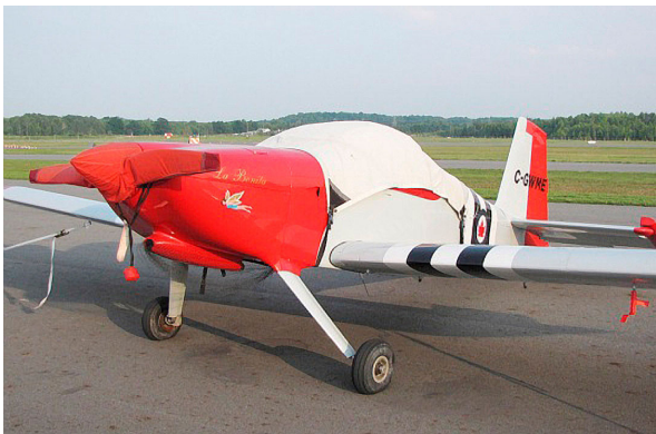
Van's RV-6 2-Blade Prop Cover

This cover type is made from Silver Acrylic Sunbrella canvas and is 100% lined with a soft and smooth microfiber. Bruce's Custom Covers developed this material combination especially for aircraft protection. The outer material is medium weight and treated for water resistance, UV resistance and anti-static buildup. The inner lining is a very soft and smooth microfiber to prevent scratching. The material is very reflective, and tests show that the cabin interior temperature can be reduced to near-ambient temperature on the hottest of days. It is water, ice and snow repellent, yet breathable to allow moisture to escape from between the cover and the aircraft surface.