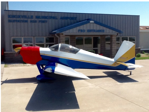
Van's RV-7 Insulated Engine Cover