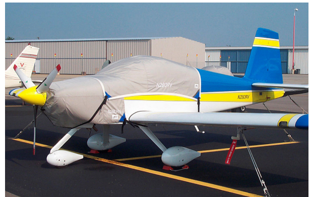
Van's RV-9 Canopy & Engine Covers