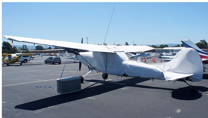
Cessna L-19 Extended Over-the-top Canopy, Engine, Empennage & Wing Covers