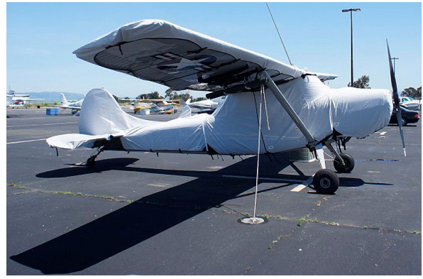
Wing Covers on Cessna Bird Dog