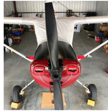
Cessna Bird Dog, L-19, O-1, 305 Engine Inlet Plugs