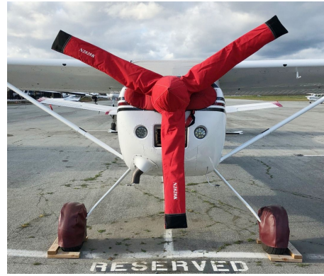
Cessna Skywagon Propellor/Spinner Cover, 3-blade type