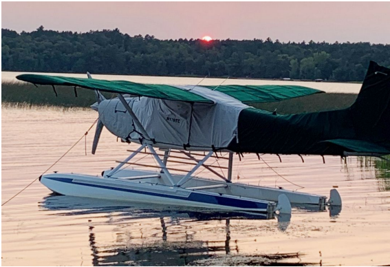
Cessna A185F Complete Cover Set

the hottest of days. It is water, ice and snow repellent, yet breathable to allow moisture to escape from between the cover and the aircraft surface.