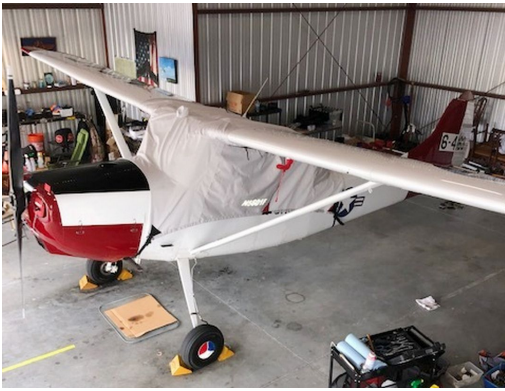
Cessna Bird Dog, L-19, O-1, 305 Canopy Cover, Over-Top Type