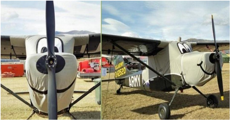
Cessna L-19 Bird Dog Canopy Cover, Engine Cover