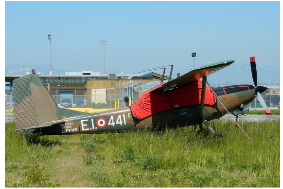
Cessna L-19 Bird Dog Canopy Cover