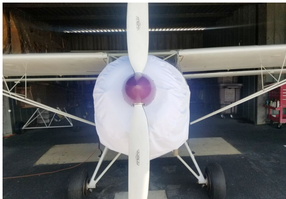
Kitfox Engine Cover, "Radial Cowl" type, test fit

This cover type is made from Silver Acrylic Sunbrella canvas and is 100% lined with a soft and smooth microfiber. Bruce's Custom Covers developed this material combination especially for aircraft protection. The outer material is medium weight and treated for water resistance, UV resistance and anti-static buildup. The inner lining is a very soft and smooth microfiber to prevent scratching. The material is very reflective, and tests show that the cabin interior temperature can be reduced to near-ambient temperature on the hottest of days. It is water, ice and snow repellent, yet breathable to allow moisture to escape from between the cover and the aircraft surface.