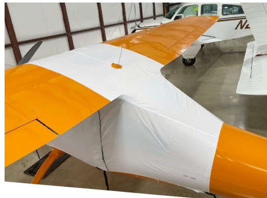
Aeromarine Merlin Over-Top Canopy Cover, test fit cover