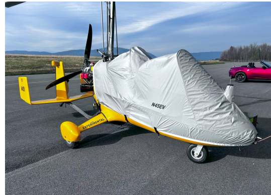
AR1 American Ranger Gyrocopter Travel Cover, Lightweight Canopy/Nose Cover