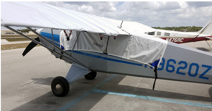
Aviat (Christen) Husky Wing Covers, All Year Use