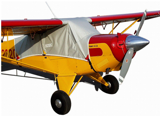
Aviat Husky Canopy Cover & Engine Plugs