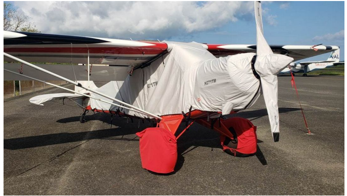
Aviat Husky Extended Canopy Cover, Engine, Prop, Empennage & Tire Covers