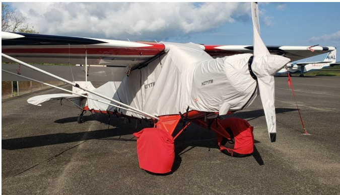
Aviat Husky Extended Canopy Cover, Engine, Prop, Empennage & Tire Covers

This cover type is made from Silver Acrylic Sunbrella canvas and is 100% lined with a soft and smooth microfiber. Bruce's Custom Covers developed this material combination especially for aircraft protection. The outer material is medium weight and treated for water resistance, UV resistance and anti-static buildup. The inner lining is a very soft and smooth microfiber to prevent scratching. The material is very reflective, and tests show that the cabin interior temperature can be reduced to near-ambient temperature on the hottest of days. It is water, ice and snow repellent, yet breathable to allow moisture to escape from between the cover and the aircraft surface.