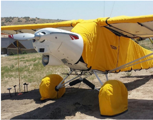
Piper PA-18 Super Cub Extended Canopy Cover, Wing & Tire Covers

ALL-YEAR USE MATERIAL - Made with Silver Acrylic Sunbrella canvas, the all-year use material is the best option for sun protection and cover longevity. This heavier more durable material is intended for all weather conditions, such as rain and snow or lots of sun.