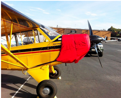
Aviat Husky Insulated Engine Cover

This cover type is made from Silver Acrylic Sunbrella canvas and is 100% lined with a soft and smooth microfiber. Bruce's Custom Covers developed this material combination especially for aircraft protection. The outer material is medium weight and treated for water resistance, UV resistance and anti-static buildup. The inner lining is a very soft and smooth microfiber to prevent scratching. The material is very reflective, and tests show that the cabin interior temperature can be reduced to near-ambient temperature on the hottest of days. It is water, ice and snow repellent, yet breathable to allow moisture to escape from between the cover and the aircraft surface.