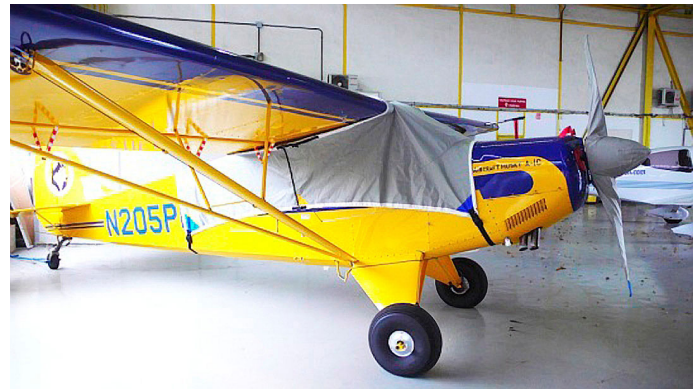
Aviat Husky Canopy & Prop Covers