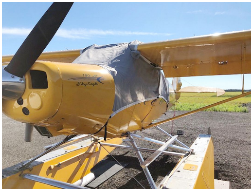
Sportsman 2+2 Wag Aero Light Weight Over the Top Travel Canopy Cover