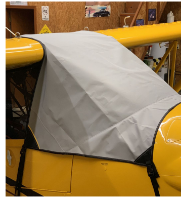
Cub Crafters Carbon Cub FX3 Windshield/Skylight Cover, travel weight