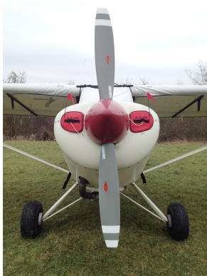
Aviat Husky Engine Plugs, Wing Covers

Engine Inlet Plugs are custom fit for your Normand Dube Aerocruiser intakes, made with heavy-duty vinyl material, and stuffed with a single block of sculpted urethane foam. Each plug has a zipper that allows the foam to be removed and dried if necessary. Engine plugs have warning flags that are visible from the cockpit or 'remove before flight' streamers sewn onto the face of the plugs. Most plugs are imprinted with the aircraft registration number in black for an extra charge. Storage bag NOT included. Engine plugs may be inserted after flight when the engine is still warm. Engine Inlet Plugs are commonly referred to as Cowl Plugs, Intake Plugs, Cowl Blocks, Engine Blocks, and Engine Bungs.