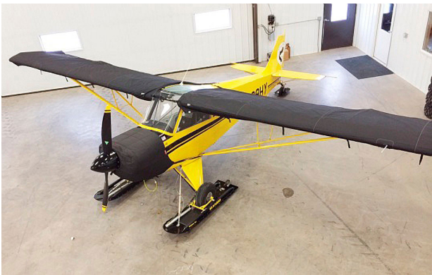
Aviat Husky Insulated Engine Cover, Wing Covers

WINTER USE MATERIAL - Made with Solution-Dyed Polyester fabric, this option is intended for seasonal use to aid in deicing, rain mitigation, or for occasional travel. The material is lighter and more compact, but more susceptible to UV damage and may have a shorter useful life if used continuously outside than the all-year use material.