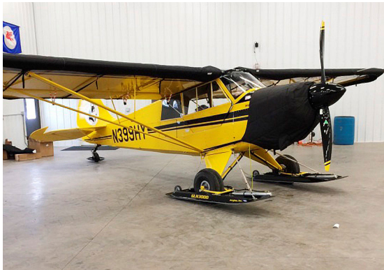
Aviat Husky Insulated Engine Cover, Wing Covers