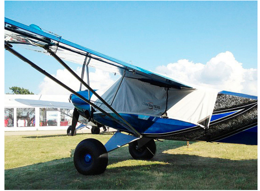
Cub Crafters Carbon Cub Canopy Cover