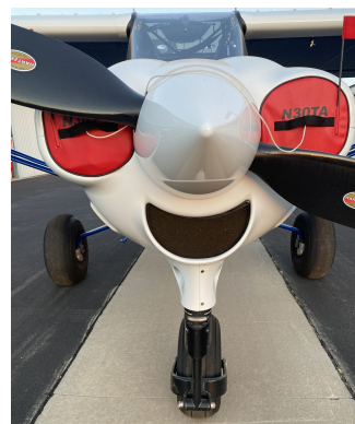
CubCrafters CC-18, 19, 20, Top Cub, CCK-1865, CC-19 X-Cub, CCX-2000, EX-3, FX-3 Engine Inlet Plugs