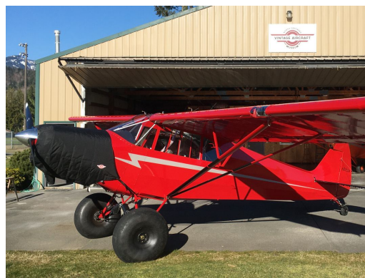
Piper PA-12 Insulated Engine Cover