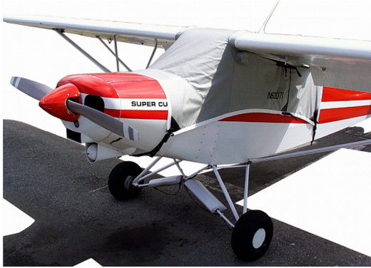
Piper PA-18 Super Cub Canopy Cover

Travel Covers are made with Silver Solution-Dyed Polyester fabric and only lined over the windshield to save weight. The material is lightweight and more compact for easy stowage in the aircraft. The polyester material is water resistant, but only intended for occasional use outside. We also have an ultra lightweight material available for fitted hangar dust covers. For daily outdoor use, the non-travel Sunbrella Cover is the best choice.