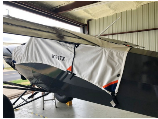
CubCrafters CCK-2000 Over The Top Canopy Cover