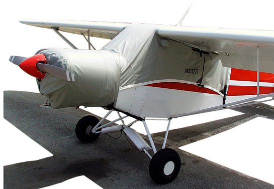
Piper PA-18 Super Cub Canopy & Engine Covers