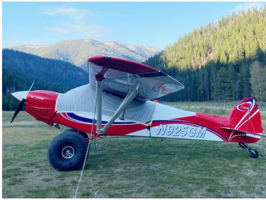
Cub Crafters CCX-2300 Canopy Cover