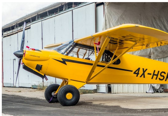
Cub Crafters Carbon Cub SS Engine Inlet Plugs & Pitot Cover

Engine Inlet Plugs are custom fit for your Lewaero Ascender intakes, made with heavy-duty vinyl material, and stuffed with a single block of sculpted urethane foam. Each plug has a zipper that allows the foam to be removed and dried if necessary. Engine plugs have warning flags that are visible from the cockpit or 'remove before flight' streamers sewn onto the face of the plugs. Most plugs are imprinted with the aircraft registration number in black for an extra charge. Storage bag NOT included. Engine plugs may be inserted after flight when the engine is still warm. Engine Inlet Plugs are commonly referred to as Cowl Plugs, Intake Plugs, Cowl Blocks, Engine Blocks, and Engine Bungs.