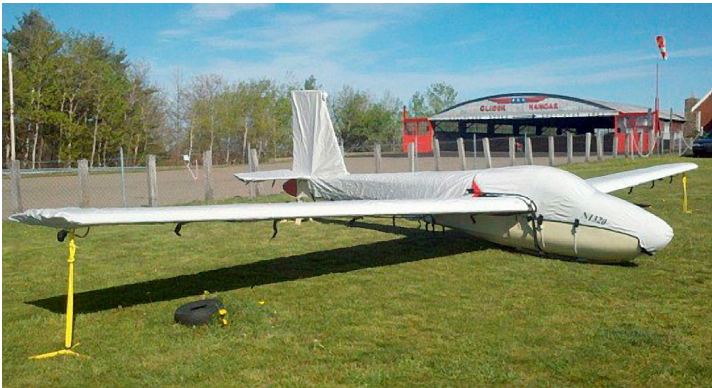
Schweizer 1-26B Canopy/Nose, Empennage & Wing Covers