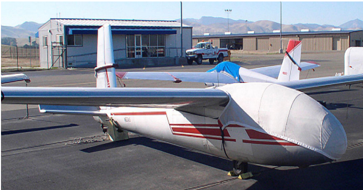
Blonik L13 Canopy/Nose Cover