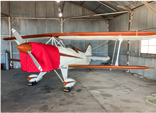
SKYBOLT, Insulated Hangar Blanket, Custom Fit Interior Use)