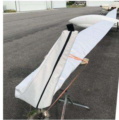
Schleicher ASW-27b Canopy/Nose & Wing Covers