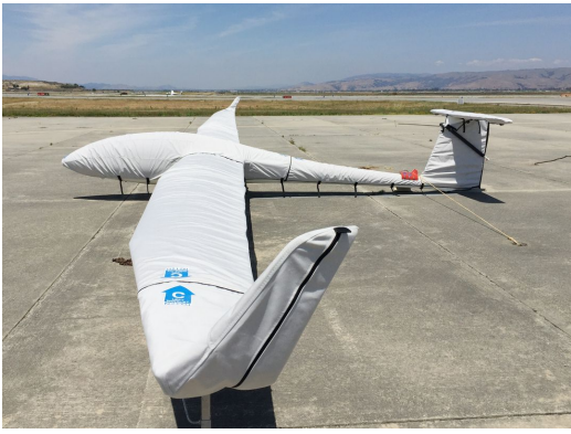
Schmepp-Hirth Discus 2B Full Cover Set