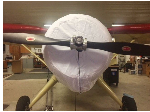
Stinson V77 Insulated Engine Cover, test fit cover