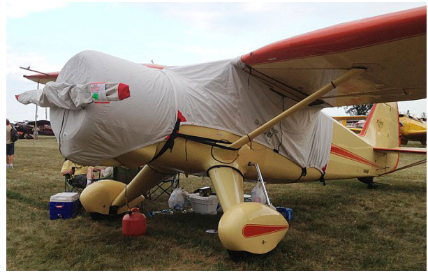
Stinson Reliant Over-the-top Canopy, Engine, and Propeller Cover