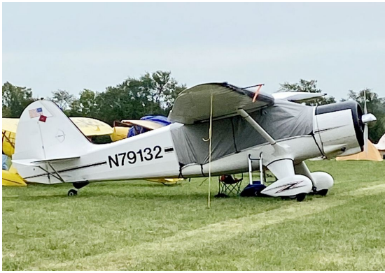
Consolidated Vultee V-77 Travel Cover