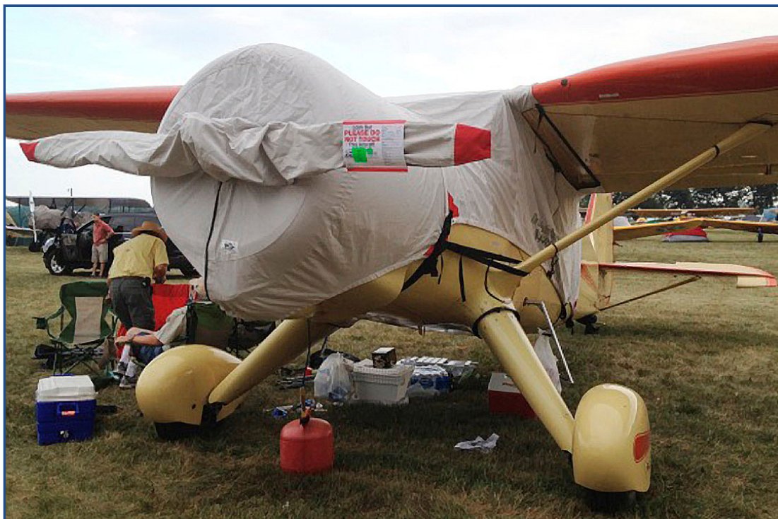
Stinson Reliant Over-the-top Canopy, Engine, and Propeller Cover