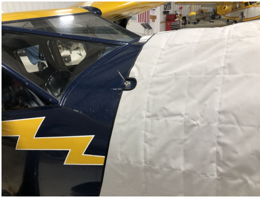
Stinson Reliant SR-10 Insulated Engine Cover