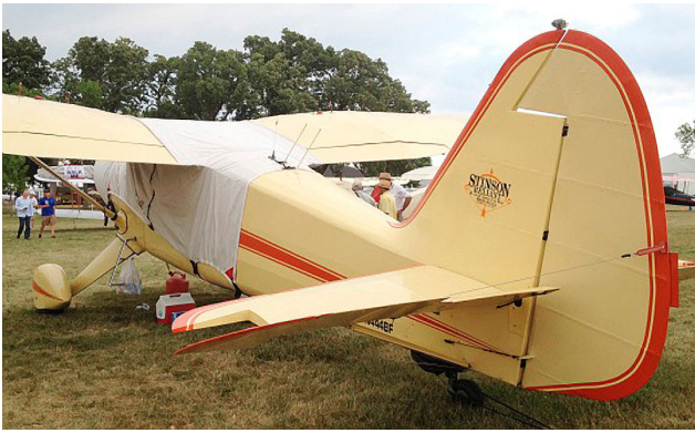
Stinson Reliant Over-the-top Canopy Cover