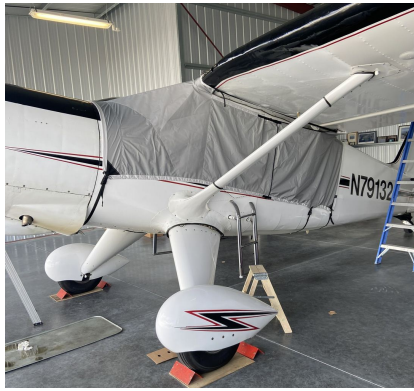
Consolidated Vultee V-77 Travel Cover