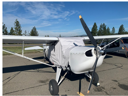
Avid Heavy Hauler MK 4 Over The Top Style Canopy Cover