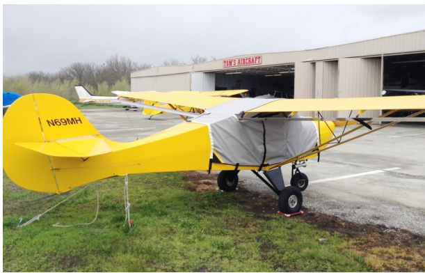
Avid Flyer Extended Canopy Cover