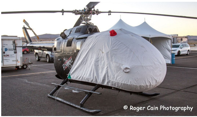
MBB BO-105 Bubble Cover