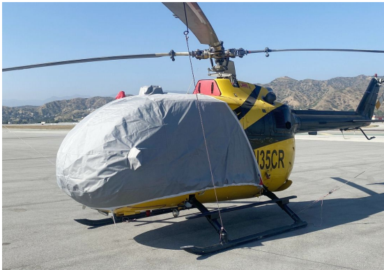
Eurocopter BO-105 Bubble Cover, Standard Model

The Engine Inlet Plugs are custom fit for your Eurocopter BO-105 intakes, made with heavy-duty vinyl material, and stuffed with a single block of sculpted urethane foam. Each plug has a zipper that allows the foam to be removed and dried if necessary. Engine plugs have 'Remove Before Flight' streamers sewn onto the face of the plugs. Most plugs are imprinted with the aircraft registration number in black for an extra charge. Storage bag NOT included. Engine plugs may be inserted after flight when the engine is still warm. Engine Inlet Plugs are commonly referred to as Cowl Plugs, Intake Plugs, Cowl Blocks, Engine Blocks, and Engine Bungs.