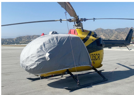
Eurocopter BO-105 Bubble Cover, Standard Model