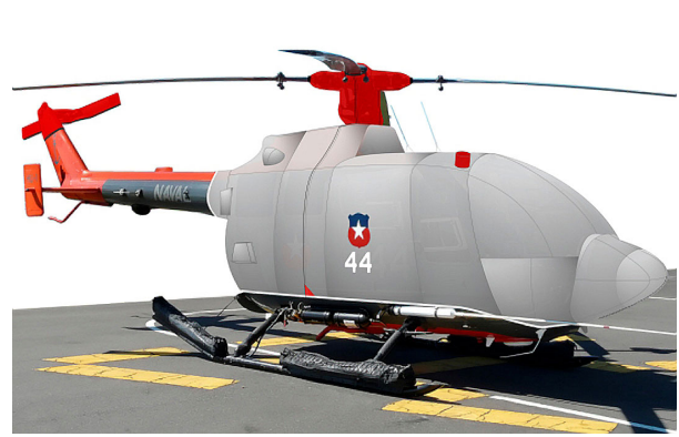
MBB BO-105 Full Body, Rotor Mast & Tail Rotor Covers (illustration)