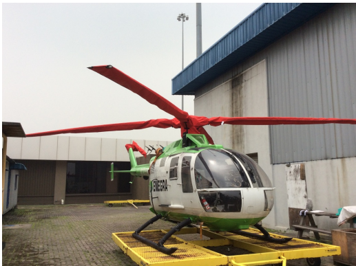
MBB BO-105 Blade, Rotor Head & Tail Rotor Covers