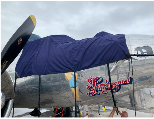
Boeing B-17 Canopy Cover