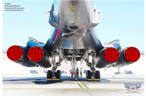
B1-B Exhaust Plugs