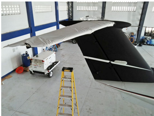
Beech King Air B350 Horizontal Stabilizer Covers

WINTER USE MATERIAL - Made with Solution-Dyed Polyester fabric, this option is intended for seasonal use to aid in deicing, rain mitigation, or for occasional travel. The material is lighter and more compact, but more susceptible to UV damage and may have a shorter useful life if used continuously outside than the all-year use material.