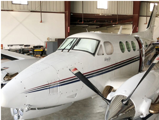
Beech King Air 90 & 100 (U-21, RU-21, T-44) Cockpit Heatshields