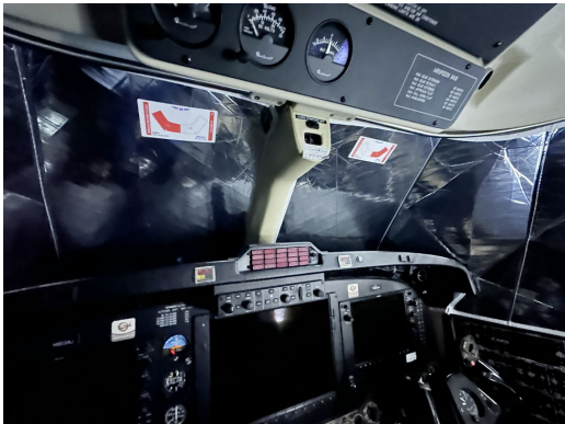
Beechcraft B200 Cockpit Heatshields

Cockpit Heatshields are interior sunshades for the aircraft's cockpit. The product is a unique composite of closed-cell foam with a silver mylar finish. The semi-rigid design is stiff enough to stand inside the window framing. The set folds up flat and is easily stored in the included storage sleeve. Some designs may require velcro and suction cups. A Heatshield is an excellent short-term remedy for cockpit overheating, but an external fabric cover is more effective for long-term protection.