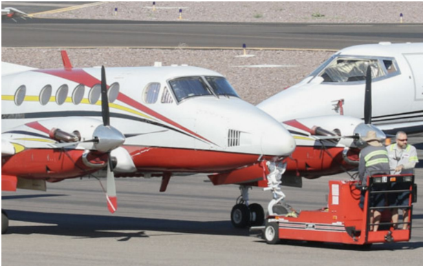
Inlet Plugs and Prop-Tie/Exhaust Covers

Engine Inlet Plugs are custom fit for your Beech King Air 200, 250, 260 (C-12, RC-12, UC-12) intakes, made with heavy-duty vinyl material, and stuffed with a single block of sculpted urethane foam. Each plug has a zipper that allows the foam to be removed and dried if necessary. Engine plugs have warning flags that are visible from the cockpit or 'remove before flight' streamers sewn onto the face of the plugs. Most plugs are imprinted with the aircraft registration number in black for an extra charge. Storage bag NOT included. Engine plugs may be inserted after flight when the engine is still warm. Engine Inlet Plugs are commonly referred to as Cowl Plugs, Intake Plugs, Cowl Blocks, Engine Blocks, and Engine Bungs.