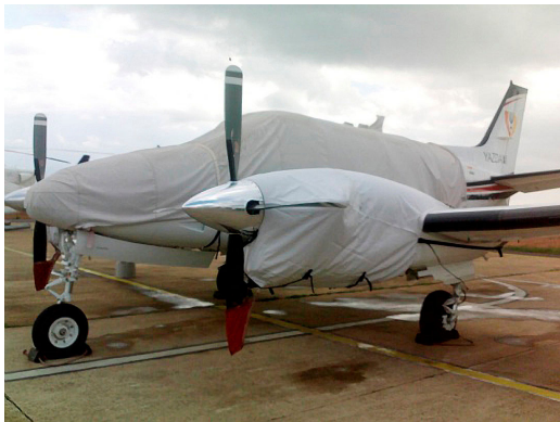
King Air C90 Canopy/Nose Cover, Engine Covers

Travel Covers are made with Silver Solution-Dyed Polyester fabric and only lined over the windshield to save weight. The material is lightweight and more compact for easy stowage in the aircraft. The polyester material is water resistant, but only intended for occasional use outside. We also have an ultra lightweight material available for fitted hangar dust covers. For daily outdoor use, the non-travel Sunbrella Cover is the best choice.