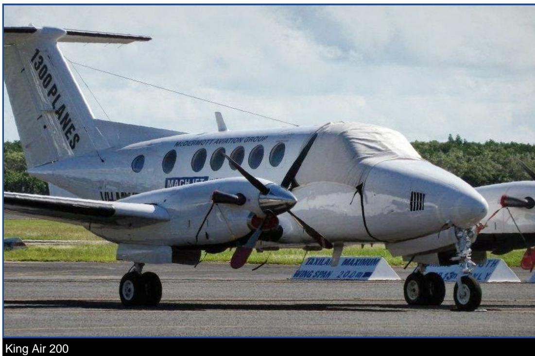
King Air 200