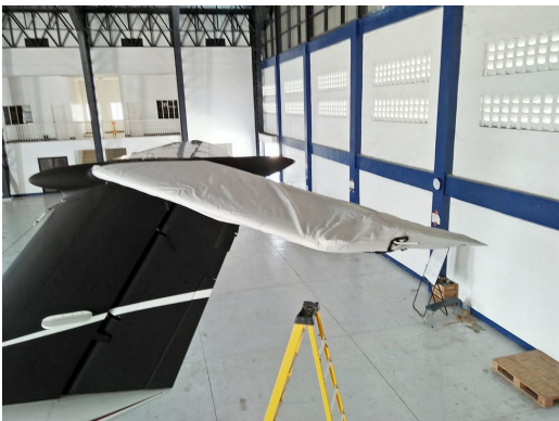
Beech King Air B350 Horizontal Stabilizer Covers