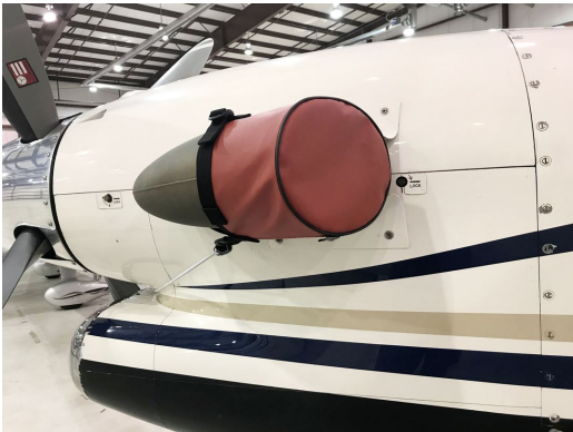
Beech King Air 350 Exhaust Covers