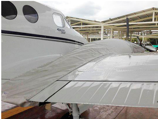
King Air C90 Engine Cover

This cover type is made from Silver Acrylic Sunbrella canvas and is 100% lined with a soft and smooth microfiber. Bruce's Custom Covers developed this material combination especially for aircraft protection. The outer material is medium weight and treated for water resistance, UV resistance and anti-static buildup. The inner lining is a very soft and smooth microfiber to prevent scratching. The material is very reflective, and tests show that the cabin interior temperature can be reduced to near-ambient temperature on the hottest of days. It is water, ice and snow repellent, yet breathable to allow moisture to escape from between the cover and the aircraft surface.