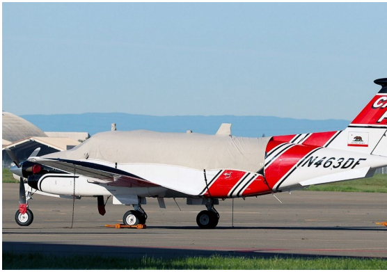
Beech King Air B200 Canopy/Nose Cover