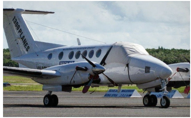
King Air 200