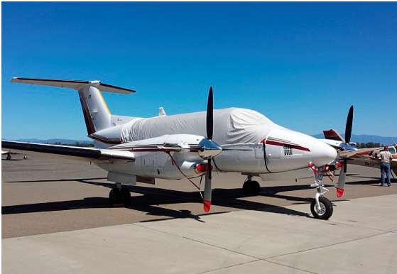
King Air 300 Canopy Cover, Engine Plugs, Prop Tie/Exhaust Covers