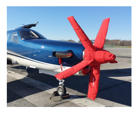
Socata TBM Insulated 5-Blade Prop/Spinner Cover