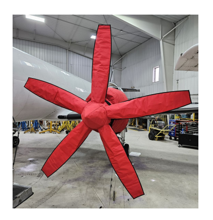
Fairchild Metro 5 Blade Insulated Insulated Prop Covers