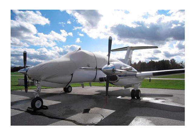
King Air B200 Canopy/Nose Cover