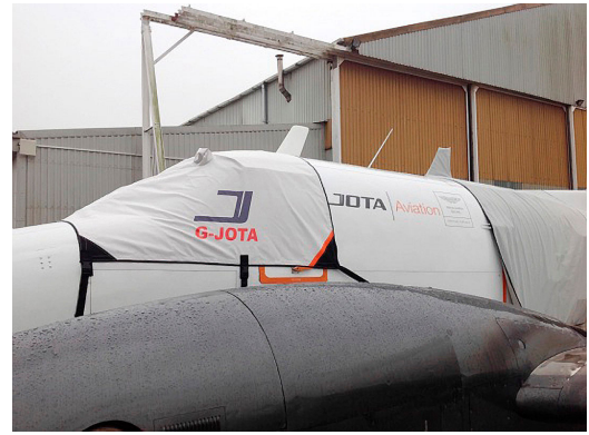
King Air Windshield/Cockpit Cover