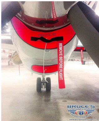
Engine and Oil Cooler Inlet Plugs

Engine Inlet Plugs are custom fit for your Beech King Air 300 intakes, made with heavy-duty vinyl material, and stuffed with a single block of sculpted urethane foam. Each plug has a zipper that allows the foam to be removed and dried if necessary. Engine plugs have warning flags that are visible from the cockpit or 'remove before flight' streamers sewn onto the face of the plugs. Most plugs are imprinted with the aircraft registration number in black for an extra charge. Storage bag NOT included. Engine plugs may be inserted after flight when the engine is still warm. Engine Inlet Plugs are commonly referred to as Cowl Plugs, Intake Plugs, Cowl Blocks, Engine Blocks, and Engine Bungs.