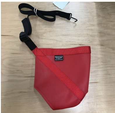
Prop Tie-Down, Various Models (secures with a hook to engine nacelle)