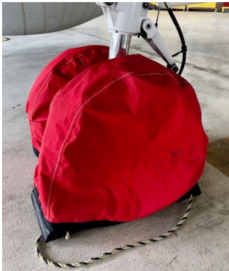
Beech King Air 300 Tire Covers (main gear)