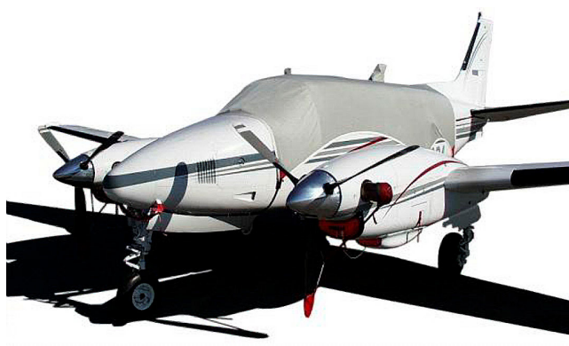
King Air Canopy Cover, Engine Plugs, Prop-Tie/Exhaust Covers