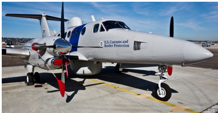
King Air 350 Engine Plugs, Prop Tie/Exhaust Covers

water resistance, UV resistance and anti-static buildup. The inner lining is a very soft and smooth microfiber to prevent scratching. The material is very reflective, and tests show that the cabin interior temperature can be reduced to near-ambient temperature on the hottest of days. It is water, ice and snow repellent, yet breathable to allow moisture to escape from between the cover and the aircraft surface.