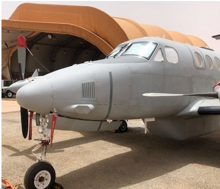
Beech King Air Cockpit HeatShields

Cockpit Heatshields are interior sunshades for the aircraft's cockpit. The product is a unique composite of closed-cell foam with a silver mylar finish. The semi-rigid design is stiff enough to stand inside the window framing. The set folds up flat and is easily stored in the included storage sleeve. Some designs may require velcro and suction cups. A Heatshield is an excellent short-term remedy for cockpit overheating, but an external fabric cover is more effective for long-term protection.