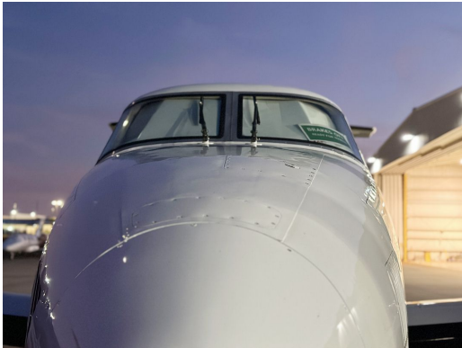
Beechcraft B200 Cockpit Heatshields