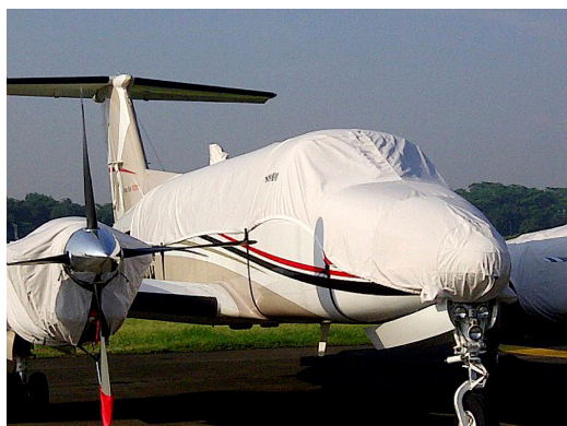
King Air 350 Canopy/Nose Cover, Engine Covers