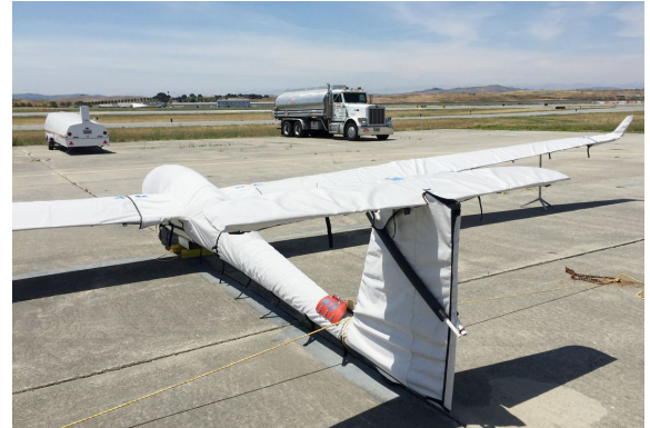
Schempp-Hirth Discus 2B Full Cover Set