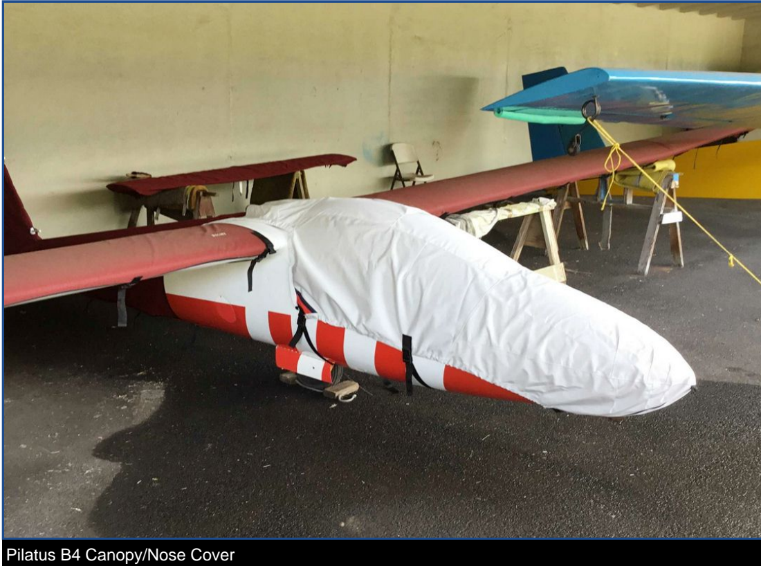
Pilatus B4 Canopy/Nose Cover