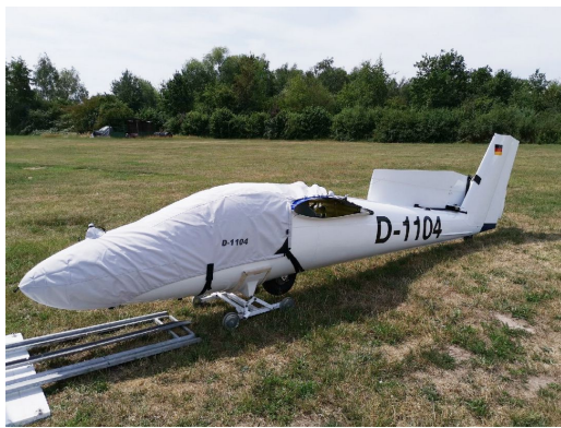
Pilatus B-4 Canopy/Nose Cover