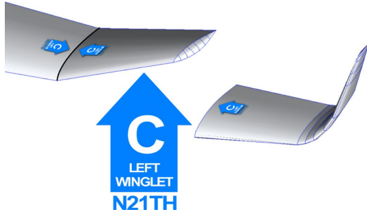
Sailplane Full Cover Set Graphic Indicators (Discus 2B, 3D model)

WINTER USE MATERIAL - Made with Solution-Dyed Polyester fabric, this option is intended for seasonal use to aid in deicing, rain mitigation, or for occasional travel. The material is lighter and more compact, but more susceptible to UV damage and may have a shorter useful life if used continuously outside than the all-year use material.