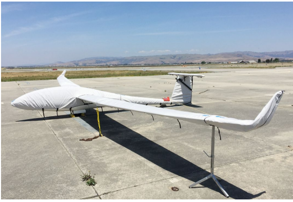
Schempp-Hirth Discus 2B Full Cover Set