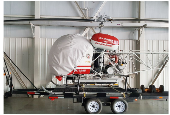
Bell 47G Bubble Cover