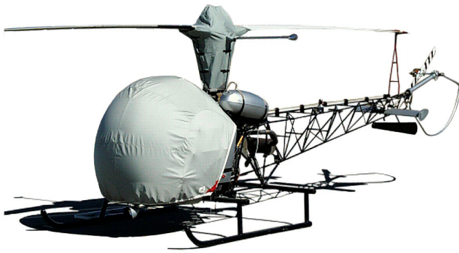
Bubble and Main Rotor Mast Covers