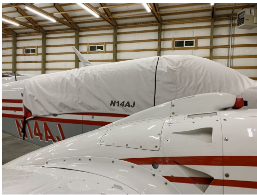
Beech Baron 58 Canopy/Nose Cover