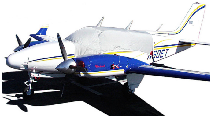
Standard Canopy Cover & Engine Plugs