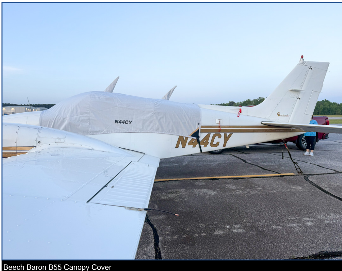
Beech Baron B55 Canopy Cover