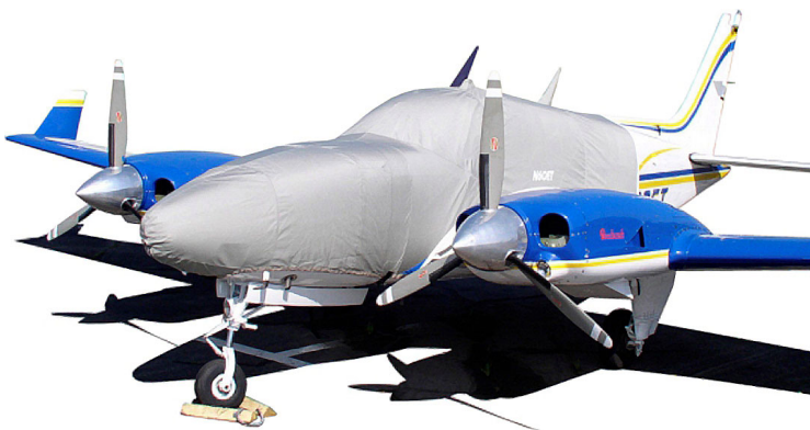
Baron Canopy/Nose Cover

Travel Covers are made with Silver Solution-Dyed Polyester fabric and only lined over the windshield to save weight. The material is lightweight and more compact for easy stowage in the aircraft. The polyester material is water resistant, but only intended for occasional use outside. We also have an ultra lightweight material available for fitted hangar dust covers. For daily outdoor use, the non-travel Sunbrella Cover is the best choice.