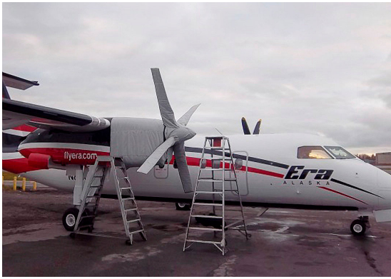
Dash 8 Insulated Engine & Prop Covers