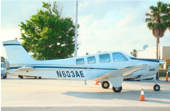
Beech Bonanza Heatshield Set