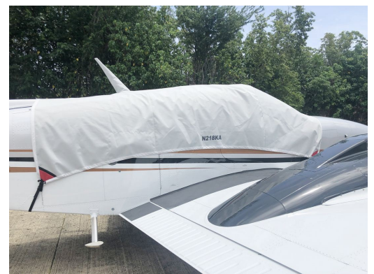
Baron G58 Travel Cover