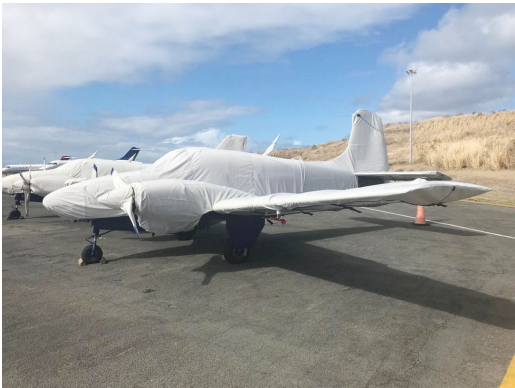
Beech Travel Air Full Cover Set

WINTER USE MATERIAL - Made with Solution-Dyed Polyester fabric, this option is intended for seasonal use to aid in deicing, rain mitigation, or for occasional travel. The material is lighter and more compact, but more susceptible to UV damage and may have a shorter useful life if used continuously outside than the all-year use material.