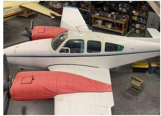
Beech Baron B55 Insulated Engine Covers