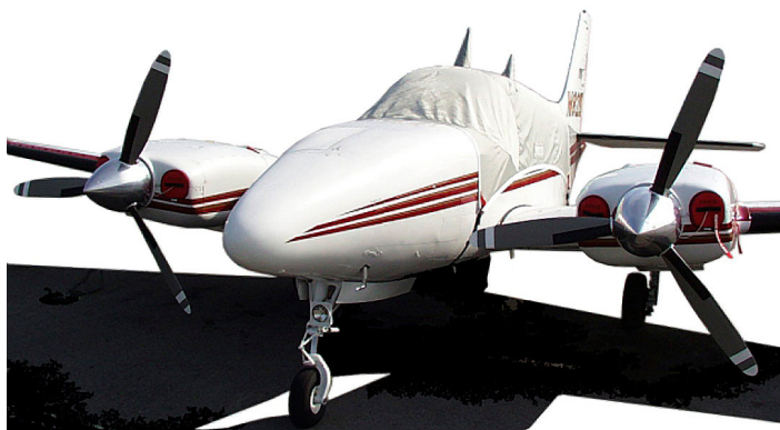
Baron 58 Standard Canopy Cover & Engine Plugs