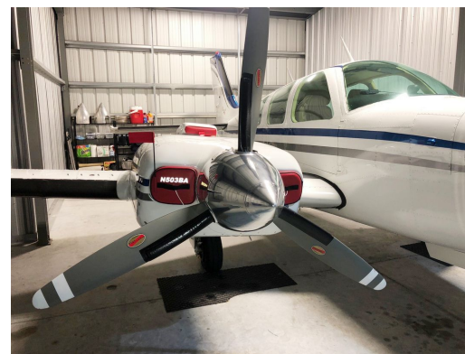
Beech Baron Engine Plugs