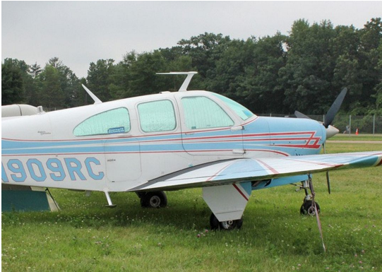
Beech Bonanza/Debonair HeatShield Set

Windshield Heatshields are interior sunshades for an aircraft's front windshield. The product is a unique composite of closed-cell foam with a silver mylar finish. The semi-rigid design is stiff enough to stand along the inside of the windshield using sun visors or window framing. It folds up flat and easily stores in the included storage sleeve. Some designs may require velcro and suction cups or split right and left sides. A Heatshield is an excellent short-term remedy for cockpit overheating. An external fabric cover is far more effective and practical for long-term protection.