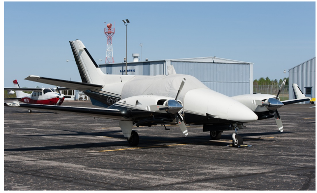
Beech Duke Canopy Cover