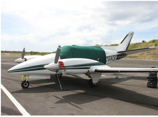
Beech Duke Canopy Cover, Engine Plugs