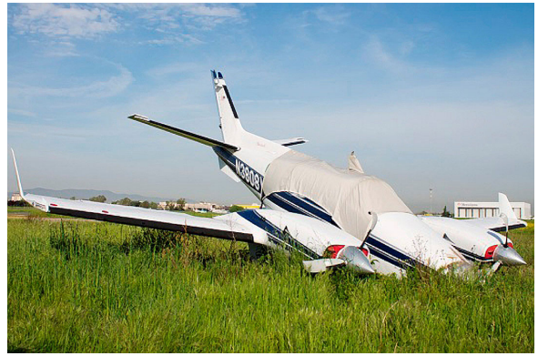
Beech Duke Canopy Cover & Engine Plugs