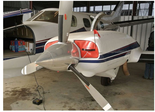
Beech Duke Engine Inlet Plugs