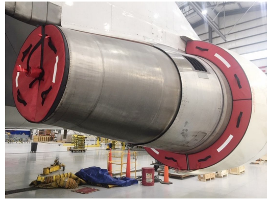
Boeing 747 Bypass Vent & Turbine Exhaust Pugs