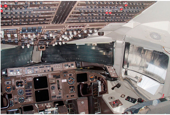
Boeing 757 Cockpit HeatShield set