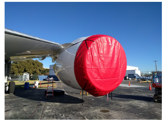
Boeing 787 Intake Cover