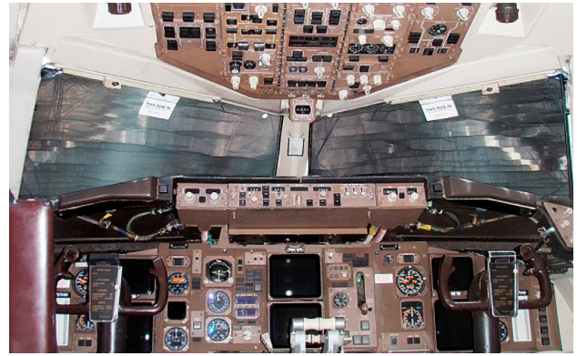
Boeing 757 Cockpit HeatShield set