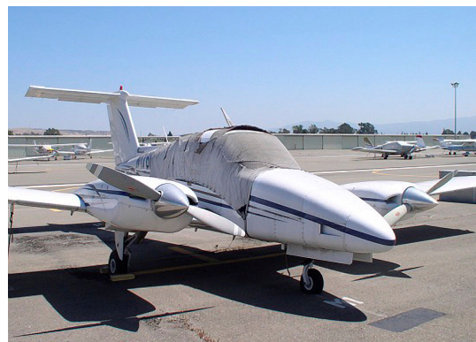
Beech Duchess Canopy Cover