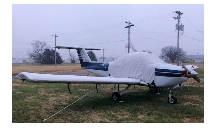
Beech Skipper Extended Canopy Cover, Wing & Horiz. Stab. Covers