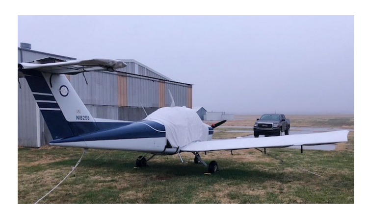
Beech Skipper Extended Canopy Cover and Inlet Plugs