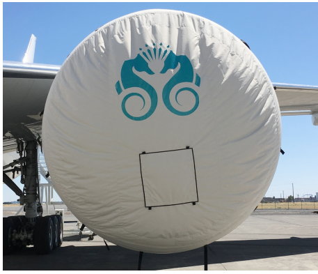
Boeing 777 Intake Covers, GE Engine