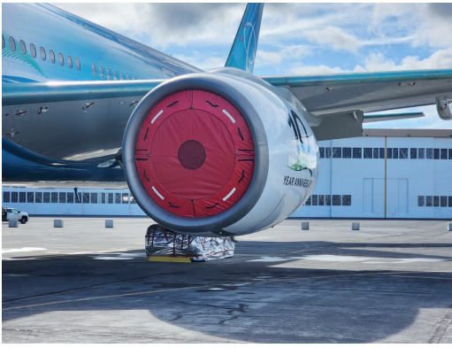
Boeing 777 Intake Plugs, Folding Type