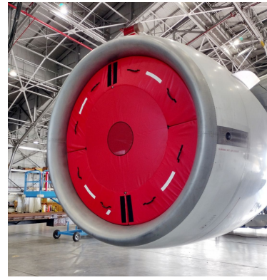
Boeing 777 Intake Plugs, Folding Type