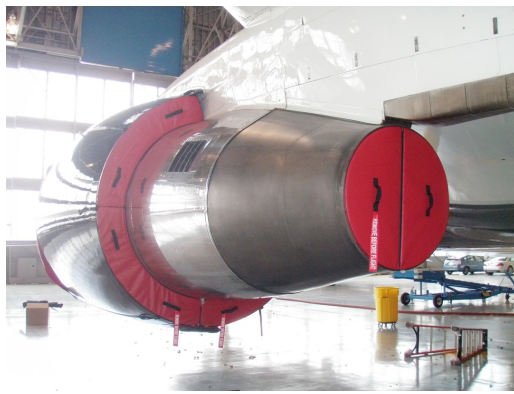
Exhaust Plugs Ship Set, incl. Fan Thrust Reverser and Exhaust Plugs P/N: B767-200