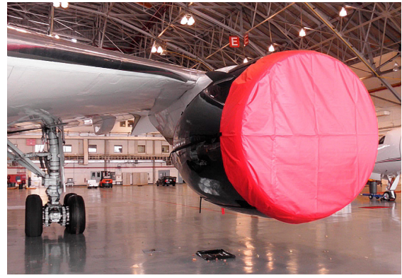
Boeing 767 Intake Covers, P/N: B767-105