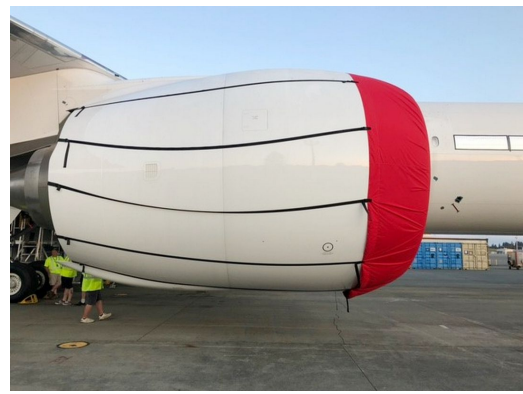
Boeing 777 Intake Covers, GE9X Engine