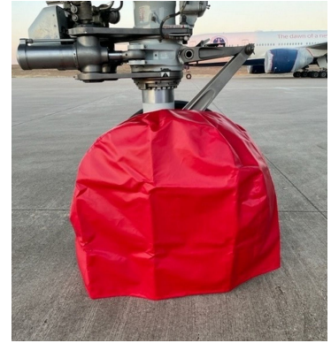
Boeing 777 Nose Gear Tire Covers