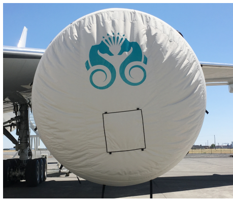
Boeing 777 Intake Covers, GE Engine