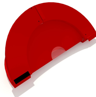
Airbus A330 Intake Plug, framed bi-fold type