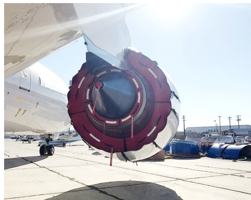
Boeing 787 Dreamliner Bypass Vent, Turbine Exhaust, & Exhaust Nozzle Plugs, Genx Engines