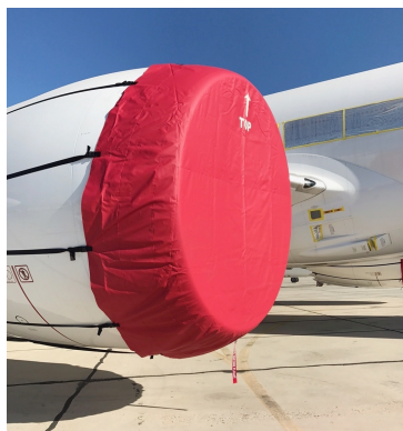
Boeing 787 Dreamliner Intake Covers Kit, Oem Type, Each, Boeing P/N: K10011-1 (Equals Qty 2 Of K10011-2), Adjustable Straps To Bypass Attachment Detail