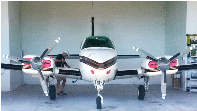
Beech Baron 58 Engine Inlet Plugs, Heater Inlet Plugs

Engine Inlet Plugs are custom fit for your Beech Travel Air B95 intakes, made with heavy-duty vinyl material, and stuffed with a single block of sculpted urethane foam. Each plug has a zipper that allows the foam to be removed and dried if necessary. Engine plugs have warning flags that are visible from the cockpit or 'remove before flight' streamers sewn onto the face of the plugs. Most plugs are imprinted with the aircraft registration number in black for an extra charge. Storage bag NOT included. Engine plugs may be inserted after flight when the engine is still warm. Engine Inlet Plugs are commonly referred to as Cowl Plugs, Intake Plugs, Cowl Blocks, Engine Blocks, and Engine Bungs.