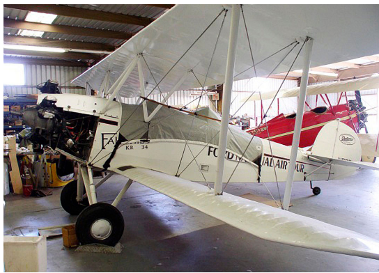
Fairchild KR-34 Canopy Cover