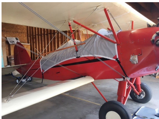
Bird BK Travel Canopy Cover

Travel Covers are made with Silver Solution-Dyed Polyester fabric and only lined over the windshield to save weight. The material is lightweight and more compact for easy stowage in the aircraft. The polyester material is water resistant, but only intended for occasional use outside. We also have an ultra lightweight material available for fitted hangar dust covers. For daily outdoor use, the non-travel Sunbrella Cover is the best choice.