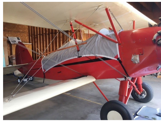
Bird BK Travel Canopy Cover