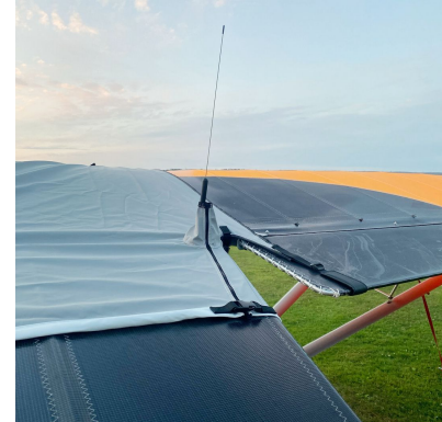
Skyreach Bushcat Travel Weight Canopy Cover