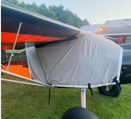
Skyreach Bushcat Travel Weight Canopy Cover

This cover type is made from Silver Acrylic Sunbrella canvas and is 100% lined with a soft and smooth microfiber. Bruce's Custom Covers developed this material combination especially for aircraft protection. The outer material is medium weight and treated for water resistance, UV resistance and anti-static buildup. The inner lining is a very soft and smooth microfiber to prevent scratching. The material is very reflective, and tests show that the cabin interior temperature can be reduced to near-ambient temperature on the hottest of days. It is water, ice and snow repellent, yet breathable to allow moisture to escape from between the cover and the aircraft surface.