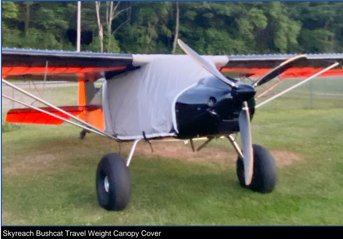
Skyreach Bushcat Travel Weight Canopy Cover