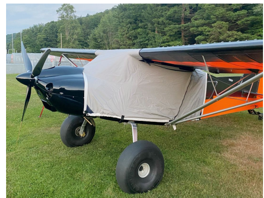
Skyreach Bushcat Travel Weight Canopy Cover