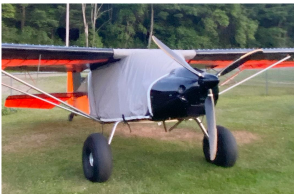
Skyreach Bushcat Travel Weight Canopy Cover

Travel Covers are made with Silver Solution-Dyed Polyester fabric and only lined over the windshield to save weight. The material is lightweight and more compact for easy stowage in the aircraft. The polyester material is water resistant, but only intended for occasional use outside. We also have an ultra lightweight material available for fitted hangar dust covers. For daily outdoor use, the non-travel Sunbrella Cover is the best choice.