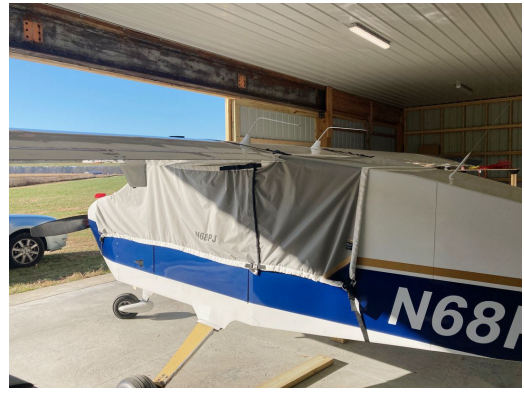
Bede BD-4 Travel Cover, Light Weight Canopy Cover, Wrap-Around