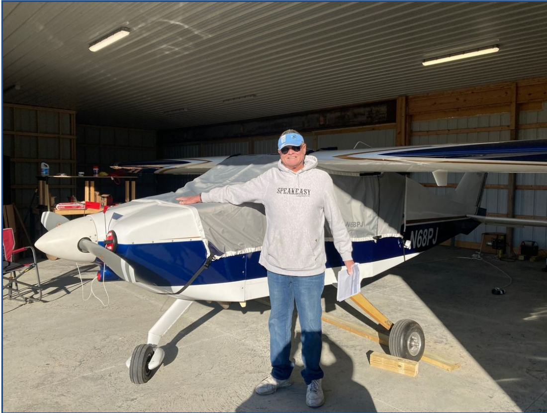
Bede BD-4 Travel Cover, Light Weight Canopy Cover, Wrap-Around