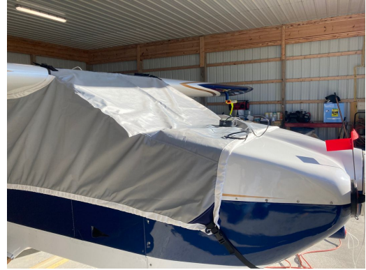
Bede BD-4 Travel Cover, Light Weight Canopy Cover, Wrap-Around