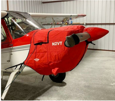
Bellanca Citabria Insulated Engine Cover

This cover type is made from Silver Acrylic Sunbrella canvas and is 100% lined with a soft and smooth microfiber. Bruce's Custom Covers developed this material combination especially for aircraft protection. The outer material is medium weight and treated for water resistance, UV resistance and anti-static buildup. The inner lining is a very soft and smooth microfiber to prevent scratching. The material is very reflective, and tests show that the cabin interior temperature can be reduced to near-ambient temperature on the hottest of days. It is water, ice and snow repellent, yet breathable to allow moisture to escape from between the cover and the aircraft surface.