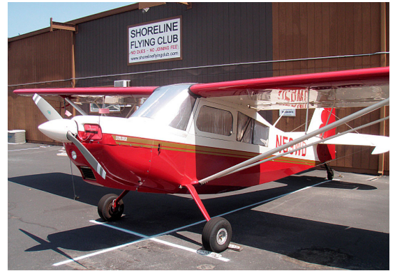
Bellanca Citabria Cabin HeatShield Set