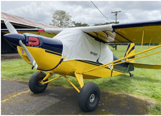
American Champion Citabria canopy cover over the top style, extends to cover gas caps, Engine Plugs