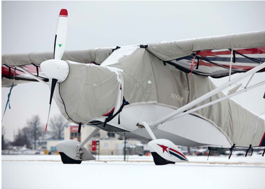
Bellanca Decathlon Canopy Cover (extended aft), Engine & Wing Covers

WINTER USE MATERIAL - Made with Solution-Dyed Polyester fabric, this option is intended for seasonal use to aid in deicing, rain mitigation, or for occasional travel. The material is lighter and more compact, but more susceptible to UV damage and may have a shorter useful life if used continuously outside than the all-year use material.