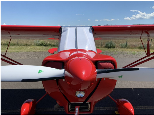
Bellanca Decathlon 8KCAB Heatshield Set with white side out

Windshield Heatshields are interior sunshades for an aircraft's front windshield. The product is a unique composite of closed-cell foam with a silver mylar finish. The semi-rigid design is stiff enough to stand along the inside of the windshield using sun visors or window framing. It folds up flat and easily stores in the included storage sleeve. Some designs may require velcro and suction cups or split right and left sides. A Heatshield is an excellent short-term remedy for cockpit overheating. An external fabric cover is far more effective and practical for long-term protection.