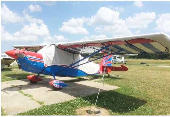
Bellanca Decathlon Canopy Cover (Over-Top, Extended to tail), Wing Covers, Engine Plugs