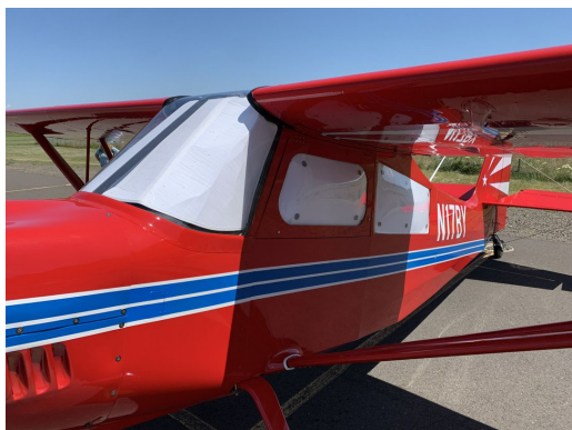
Bellanca Decathlon 8KCAB Heatshield Set with white side out

Windshield Heatshields are interior sunshades for an aircraft's front windshield. The product is a unique composite of closed-cell foam with a silver mylar finish. The semi-rigid design is stiff enough to stand along the inside of the windshield using sun visors or window framing. It folds up flat and easily stores in the included storage sleeve. Some designs may require velcro and suction cups or split right and left sides. A Heatshield is an excellent short-term remedy for cockpit overheating. An external fabric cover is far more effective and practical for long-term protection.