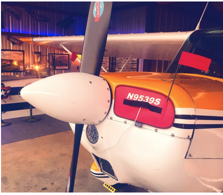
Bellanca Citabria Engine Plugs