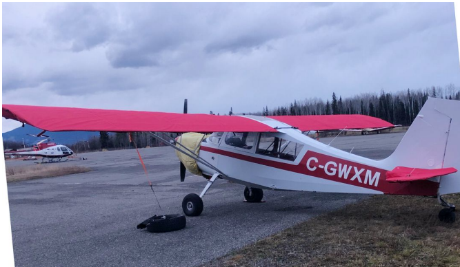
Bellanca Scout 8GCBC Wing & Horizontal Stabilizer Covers

WINTER USE MATERIAL - Made with Solution-Dyed Polyester fabric, this option is intended for seasonal use to aid in deicing, rain mitigation, or for occasional travel. The material is lighter and more compact, but more susceptible to UV damage and may have a shorter useful life if used continuously outside than the all-year use material.