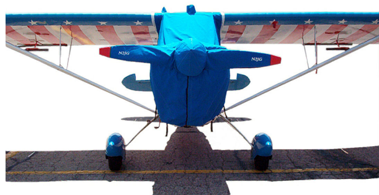
Bellanca Citabria Propellor & Engine Covers

This cover type is made from Silver Acrylic Sunbrella canvas and is 100% lined with a soft and smooth microfiber. Bruce's Custom Covers developed this material combination especially for aircraft protection. The outer material is medium weight and treated for water resistance, UV resistance and anti-static buildup. The inner lining is a very soft and smooth microfiber to prevent scratching. The material is very reflective, and tests show that the cabin interior temperature can be reduced to near-ambient temperature on the hottest of days. It is water, ice and snow repellent, yet breathable to allow moisture to escape from between the cover and the aircraft surface.