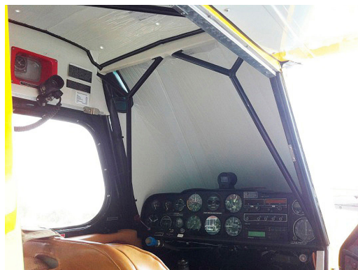
Bellanca Citabria Windshield &amp; Skylight HeatShields