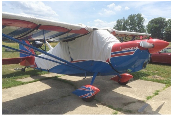
Bellanca Decathlon Canopy Cover (Over-Top, Extended to tail), Wing Covers, Engine Plugs