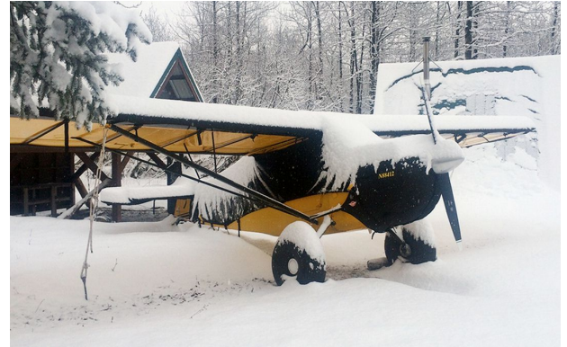
Bellanca 7GCBC Winter Use Cover Set