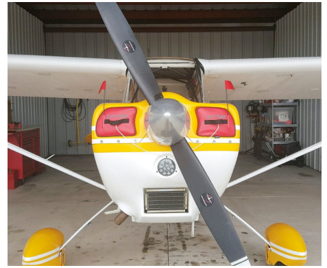
Bellanca Citabria, Scout, Explorer Engine Inlet Plugs