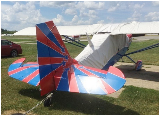
Bellanca Decathlon Canopy Cover (Over-Top, Extended to tail), Wing Covers.