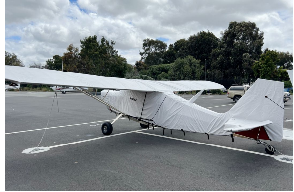
Bellanca Decathlon Full Cover Set