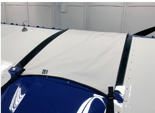
Cub Crafters CC-11 Windshild Cover

This cover type is made from Silver Acrylic Sunbrella canvas and is 100% lined with a soft and smooth microfiber. Bruce's Custom Covers developed this material combination especially for aircraft protection. The outer material is medium weight and treated for water resistance, UV resistance and anti-static buildup. The inner lining is a very soft and smooth microfiber to prevent scratching. The material is very reflective, and tests show that the cabin interior temperature can be reduced to near-ambient temperature on the hottest of days. It is water, ice and snow repellent, yet breathable to allow moisture to escape from between the cover and the aircraft surface.