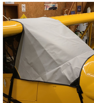
Cub Crafters Carbon Cub FX3 Windshild/Skylight Cover, travel weight