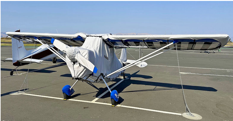
Bellanca Decathlon Cover Set