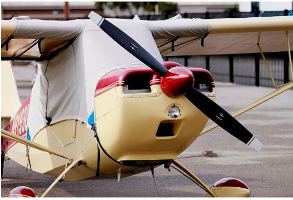
Bellanca Citabria Over-the-Top Canopy Cover, extended to cover gas caps