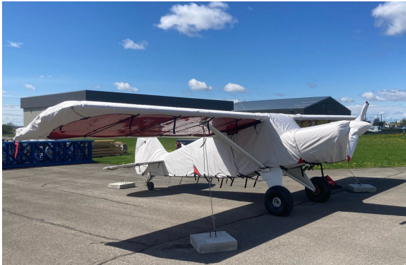
Bearhawk 4-Place Complete Cover Set, AFTER