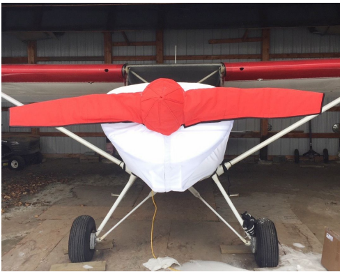
Bearhawk Engine Cover (test fit), Insulated Prop Cover