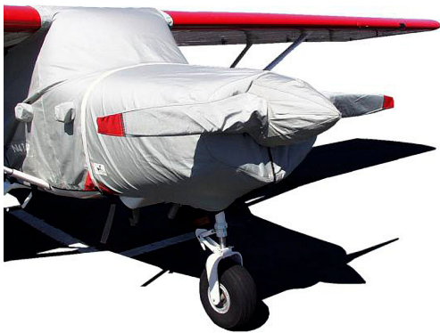
Maule M-7 Prop, Engine, Extended Canopy Covers

This cover type is made from Silver Acrylic Sunbrella canvas and is 100% lined with a soft and smooth microfiber. Bruce's Custom Covers developed this material combination especially for aircraft protection. The outer material is medium weight and treated for water resistance, UV resistance and anti-static buildup. The inner lining is a very soft and smooth microfiber to prevent scratching. The material is very reflective, and tests show that the cabin interior temperature can be reduced to near-ambient temperature on the hottest of days. It is water, ice and snow repellent, yet breathable to allow moisture to escape from between the cover and the aircraft surface.