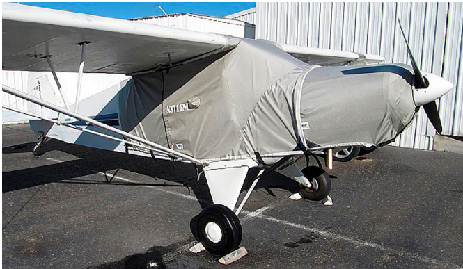
Bearhawk 2-Place Model Canopy Cover Piper PA-12 Super Cruiser Extended Over-the-Top Canopy Cover & Engine Cover