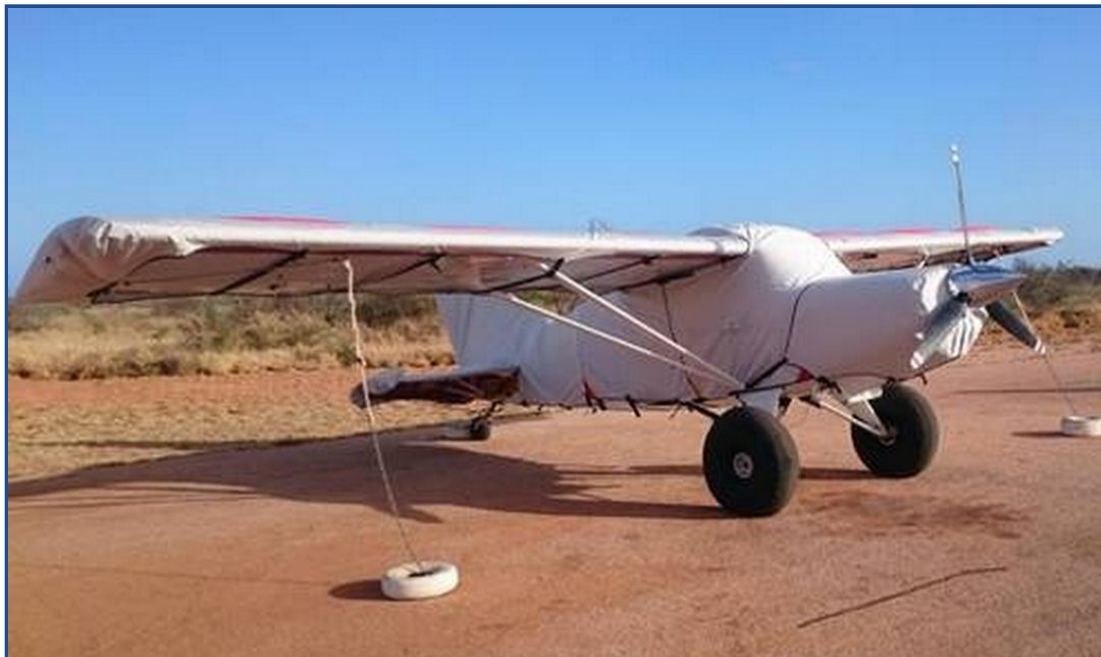
Maule M7-235 Extended Canopy, Wing, Engine &amp; Empennage Covers