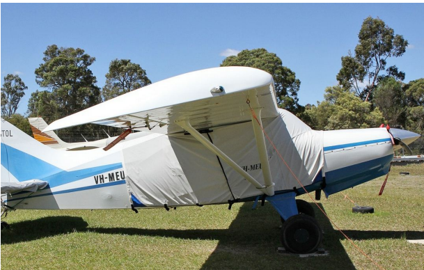
Avipro Bearhawk Extended Over The Top Canopy Cover