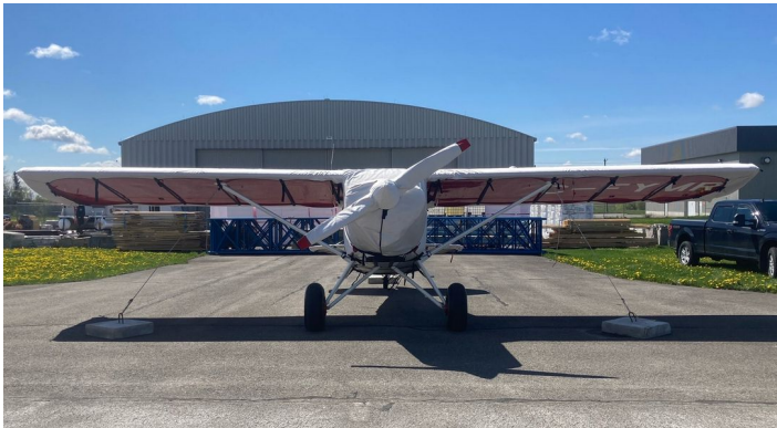
Bearhawk 4-Place Complete Cover Set