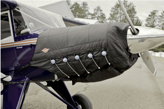
Bearhawk Insulated Engine Cover

This cover type is made from Silver Acrylic Sunbrella canvas and is 100% lined with a soft and smooth microfiber. Bruce's Custom Covers developed this material combination especially for aircraft protection. The outer material is medium weight and treated for water resistance, UV resistance and anti-static buildup. The inner lining is a very soft and smooth microfiber to prevent scratching. The material is very reflective, and tests show that the cabin interior temperature can be reduced to near-ambient temperature on the hottest of days. It is water, ice and snow repellent, yet breathable to allow moisture to escape from between the cover and the aircraft surface.