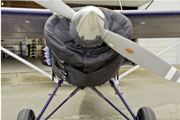
Bearhawk Insulated Engine Cover