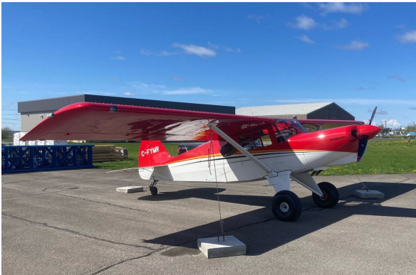
Bearhawk 4-Place Complete Cover Set, BEFORE

WINTER USE MATERIAL - Made with Solution-Dyed Polyester fabric, this option is intended for seasonal use to aid in deicing, rain mitigation, or for occasional travel. The material is lighter and more compact, but more susceptible to UV damage and may have a shorter useful life if used continuously outside than the all-year use material.