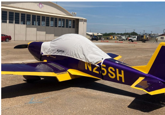
Mustang II Canopy Cover