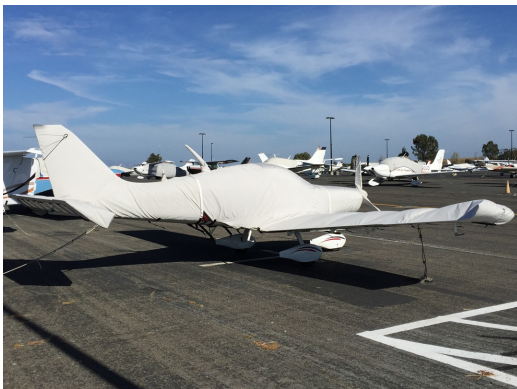
BRM Bristell S-LSA Full Cover Set

This cover type is made from Silver Acrylic Sunbrella canvas and is 100% lined with a soft and smooth microfiber. Bruce's Custom Covers developed this material combination especially for aircraft protection. The outer material is medium weight and treated for water resistance, UV resistance and anti-static buildup. The inner lining is a very soft and smooth microfiber to prevent scratching. The material is very reflective, and tests show that the cabin interior temperature can be reduced to near-ambient temperature on the hottest of days. It is water, ice and snow repellent, yet breathable to allow moisture to escape from between the cover and the aircraft surface.