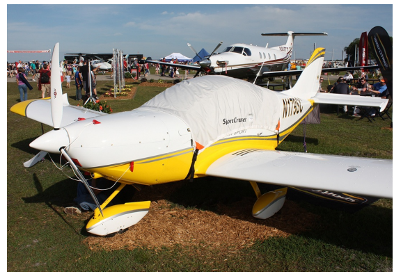
PiperSport Canopy Cover, Engine Plugs