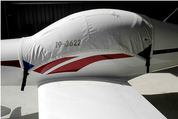
Pulsar Canopy Cover

This cover type is made from Silver Acrylic Sunbrella canvas and is 100% lined with a soft and smooth microfiber. Bruce's Custom Covers developed this material combination especially for aircraft protection. The outer material is medium weight and treated for water resistance, UV resistance and anti-static buildup. The inner lining is a very soft and smooth microfiber to prevent scratching. The material is very reflective, and tests show that the cabin interior temperature can be reduced to near-ambient temperature on the hottest of days. It is water, ice and snow repellent, yet breathable to allow moisture to escape from between the cover and the aircraft surface.