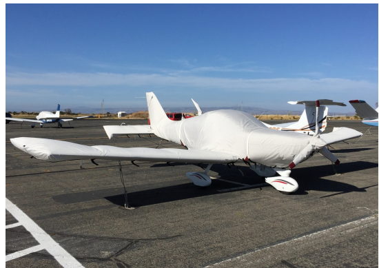
BRM Bristell S-LSA Full Cover Set