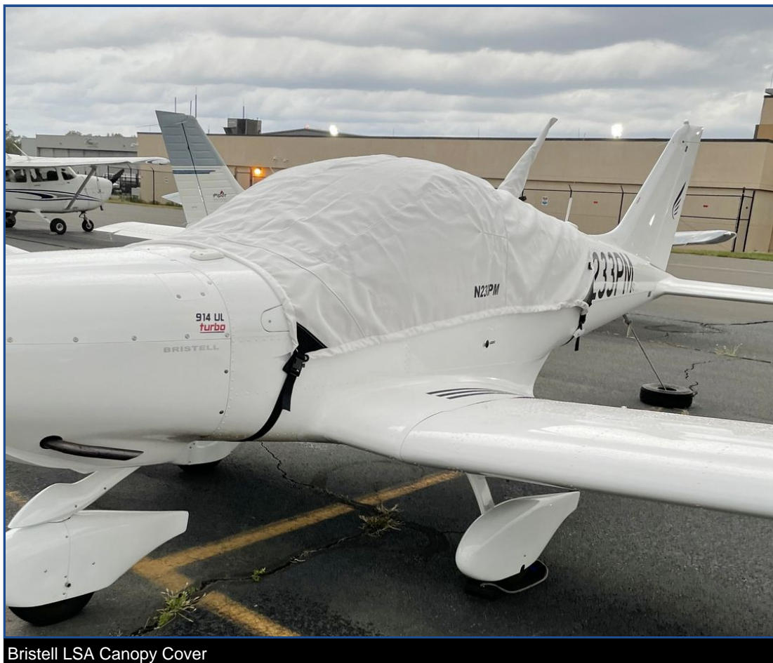
Bristell LSA Canopy Cover