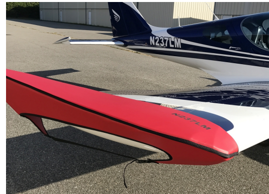
BRM Aero Bristell S-LSA Wingtip Pads