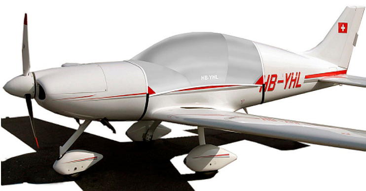
Pulsar Canopy Cover (illustration)