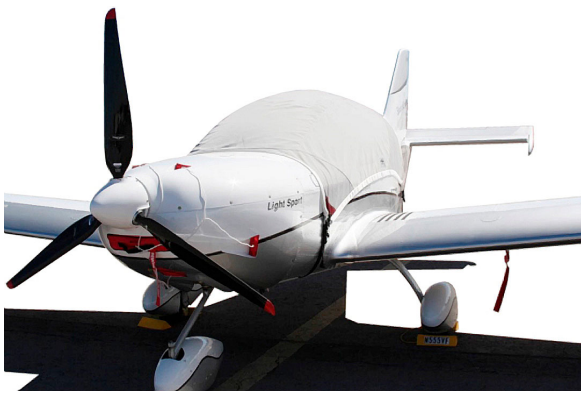
Sportcruiser Canopy Cover & Plugs