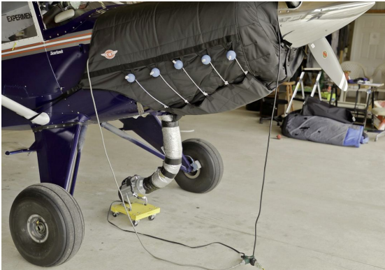
Bearhawk Insulated Engine Cover

This cover type is made from Silver Acrylic Sunbrella canvas and is 100% lined with a soft and smooth microfiber. Bruce's Custom Covers developed this material combination especially for aircraft protection. The outer material is medium weight and treated for water resistance, UV resistance and anti-static buildup. The inner lining is a very soft and smooth microfiber to prevent scratching. The material is very reflective, and tests show that the cabin interior temperature can be reduced to near-ambient temperature on the hottest of days. It is water, ice and snow repellent, yet breathable to allow moisture to escape from between the cover and the aircraft surface.