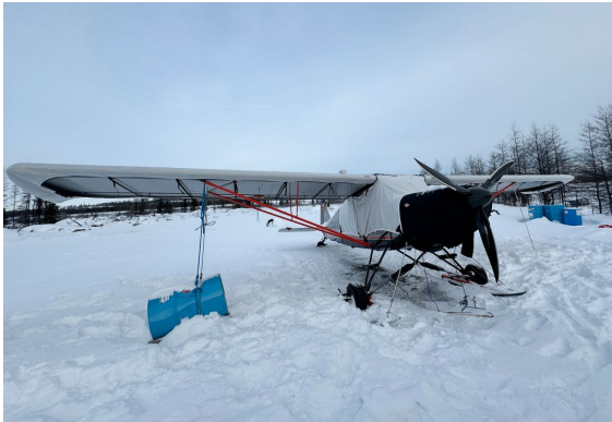
Bushmaster Wing, Canopy & Insulated Engine Covers