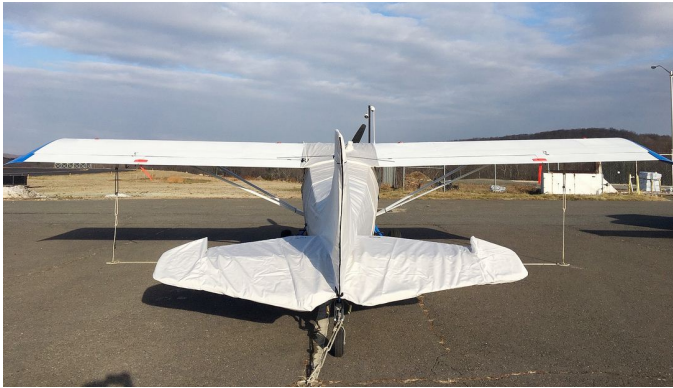
Maule M-5-235C Extended Canopy Cover, Empennage Cover