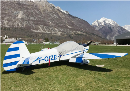
Mudry Cap 10 Canopy Cover