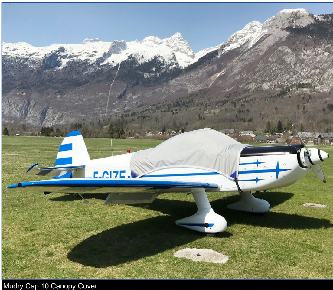
Mudry Cap 10 Canopy Cover