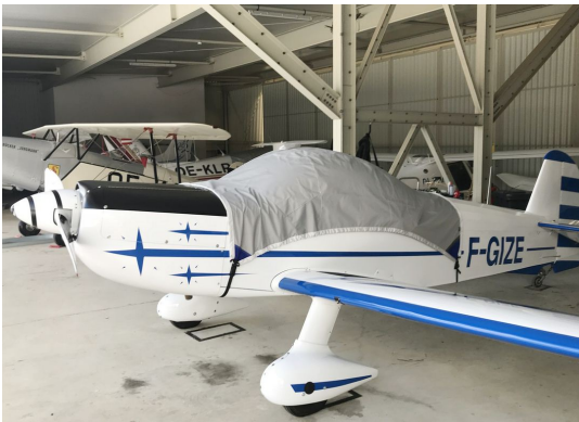
Mudry Cap 10 Travel Cover, Light Weight Travel Canopy Cover

Travel Covers are made with Silver Solution-Dyed Polyester fabric and only lined over the windshield to save weight. The material is lightweight and more compact for easy stowage in the aircraft. The polyester material is water resistant, but only intended for occasional use outside. We also have an ultra lightweight material available for fitted hangar dust covers. For daily outdoor use, the non-travel Sunbrella Cover is the best choice.