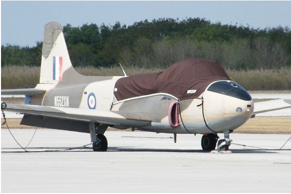
Jet Provost Canopy Cover

Travel Covers are made with Silver Solution-Dyed Polyester fabric and only lined over the windshield to save weight. The material is lightweight and more compact for easy stowage in the aircraft. The polyester material is water resistant, but only intended for occasional use outside. We also have an ultra lightweight material available for fitted hangar dust covers. For daily outdoor use, the non-travel Sunbrella Cover is the best choice.