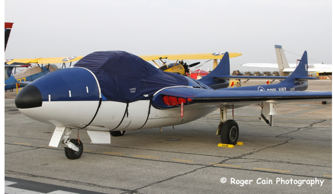
DeHavilland Vampire Canopy Cover, Engine Plugs