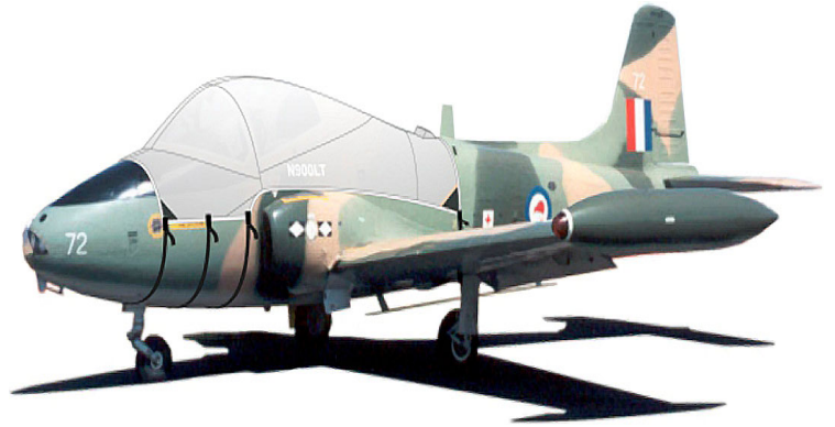
Jet Provost Canopy Cover (Illustration)